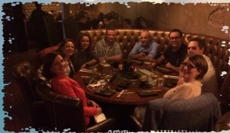
Dinner with a selection of our 'adoption group'. A little boy from China has joined the group now too.

Returning to the USA for visits is certainly an option for us too!