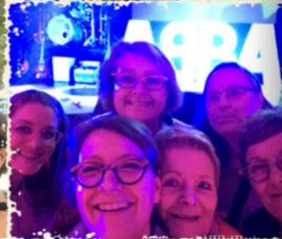
fun at an ABBA tribute concert with my mom, sister and aunts.