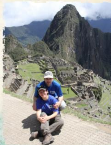
top left: Norway, family holiday top right: Chichen Itza, Mexico bottom left: Warsaw, palace of lights bottom right: Machu Picchu, Peru