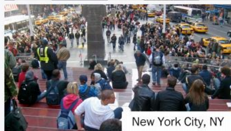
New York City, NY