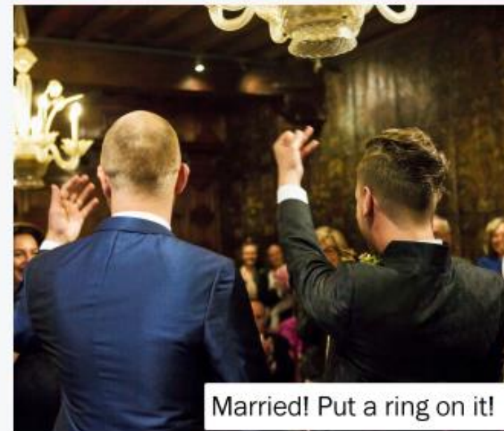
Married! Put a ring on it!

We prefer to have an open adoption, but we want you to know that we welcome whatever level of openness you feel comfortable with and we understand that may change over time. We will always respect that.