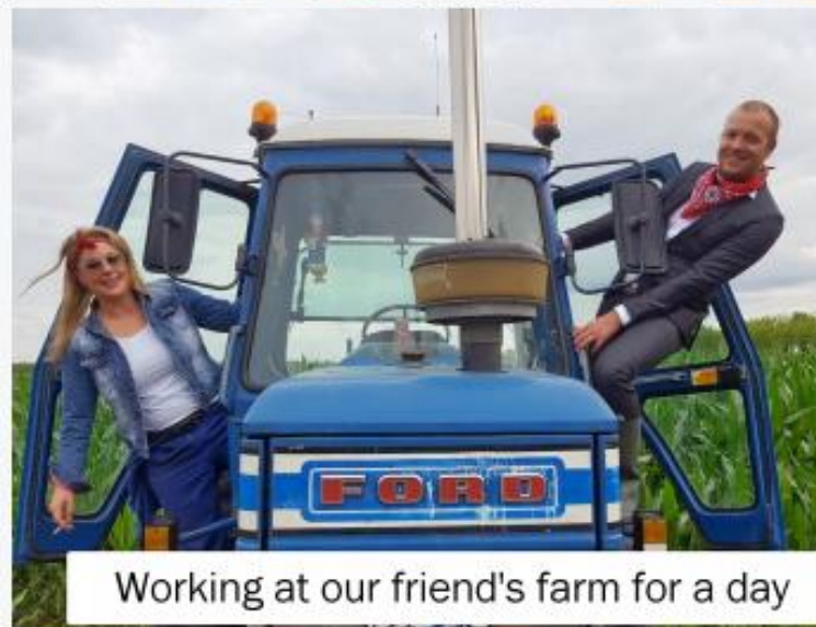
Working at our friend's farm for a day