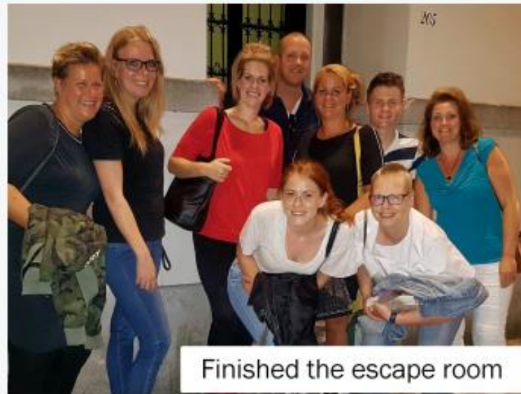
Finished the escape room