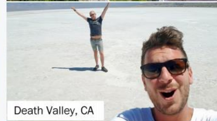
Death Valley, CA