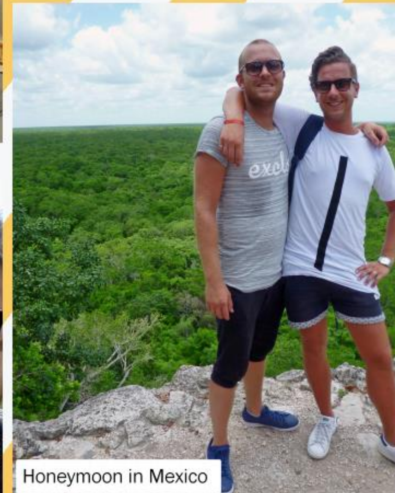
Honeymoon in Mexico