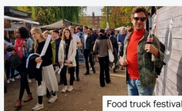
Food truck festival