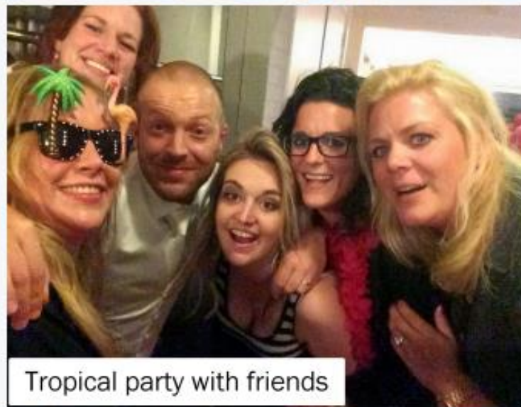
Tropical party with friends