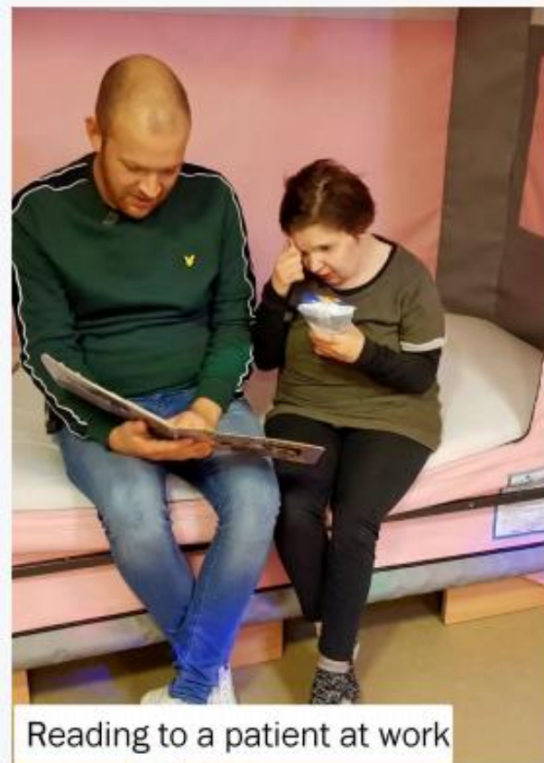
Reading to a patient at work