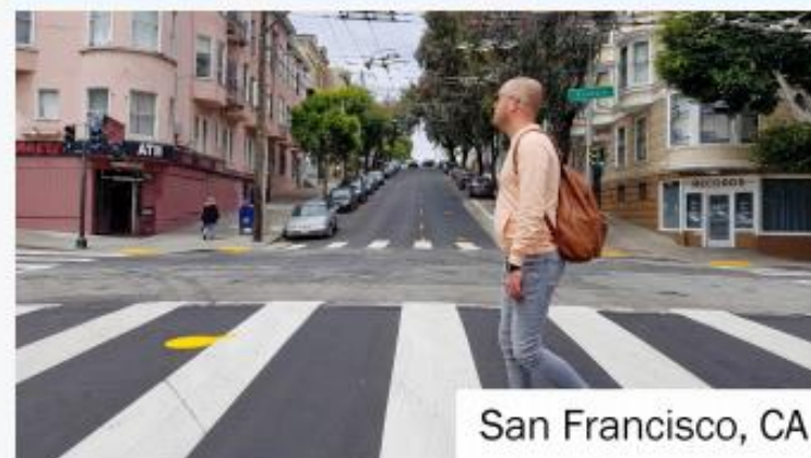
San Francisco, CA