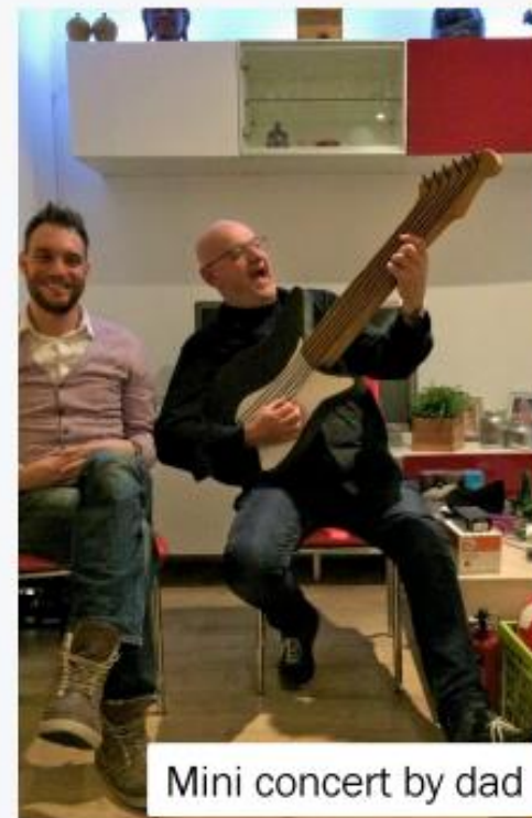
Mini concert by dad