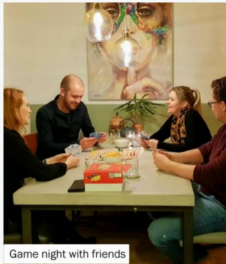
Game night with friends