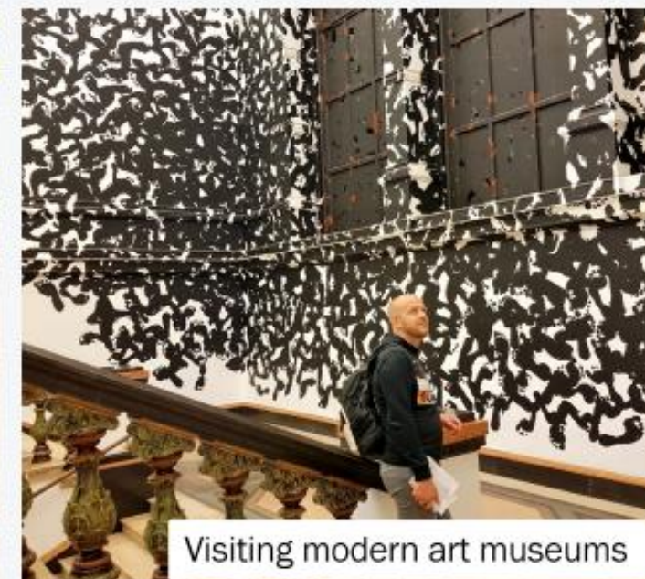
Visiting modern art museums