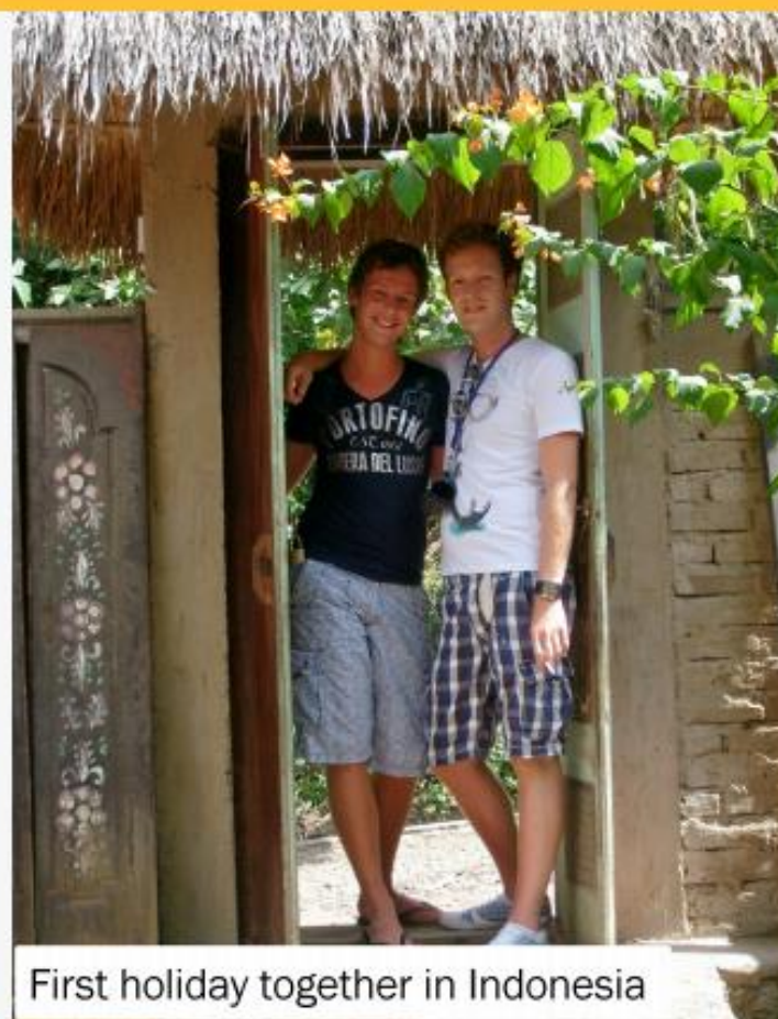
First holiday together in Indonesia