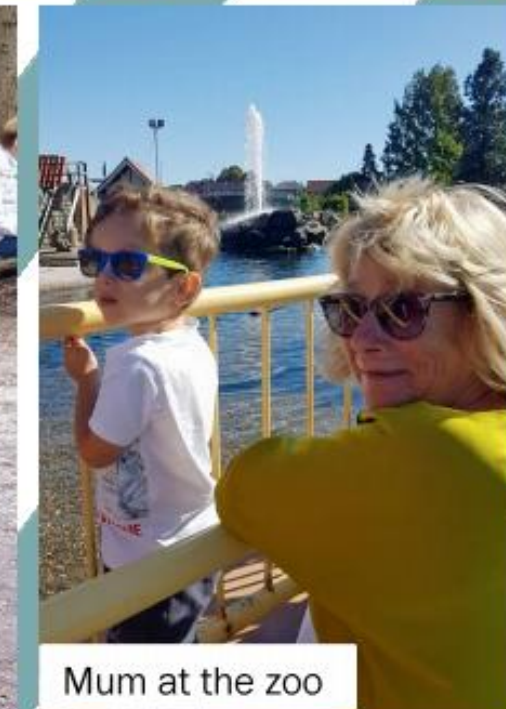
Mum at the zoo