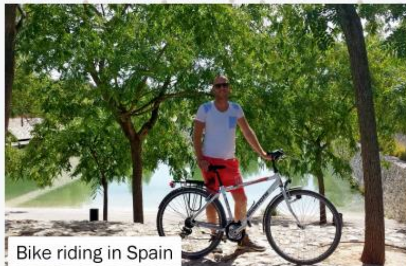
Bike riding in Spain