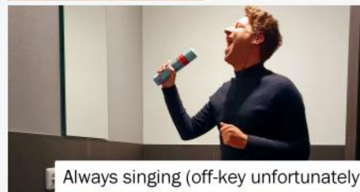
Always singing (off-key unfortunately)