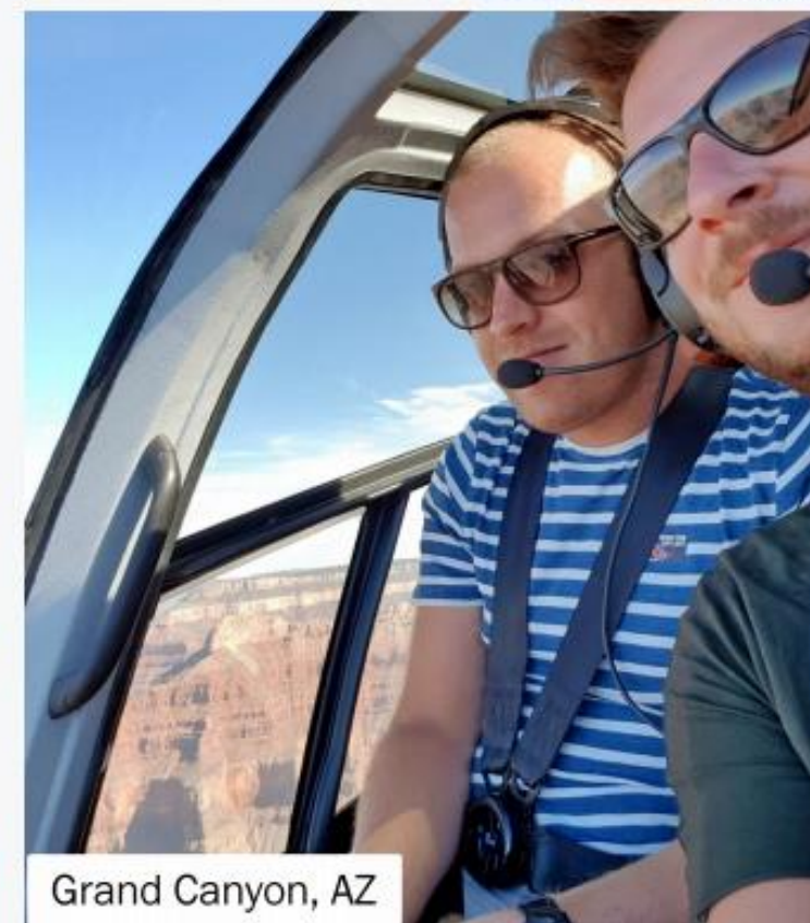
Grand Canyon, AZ