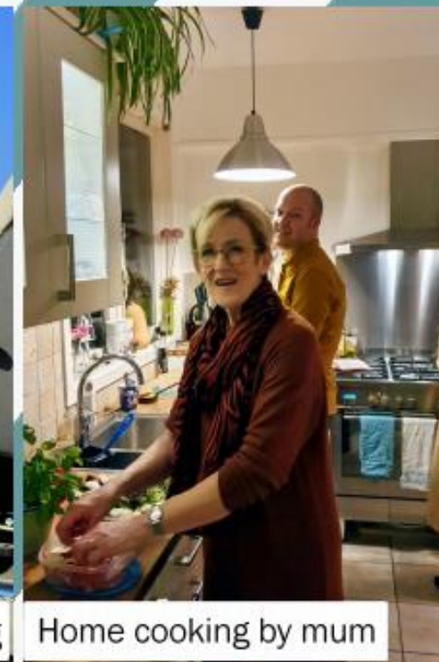
Home cooking by mum