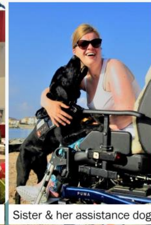
Sister & her assistance dog