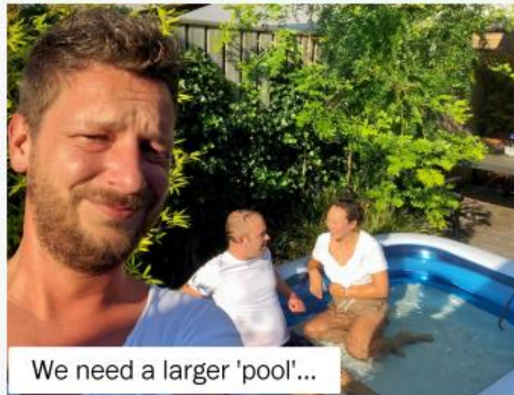
We need a larger 'pool'...