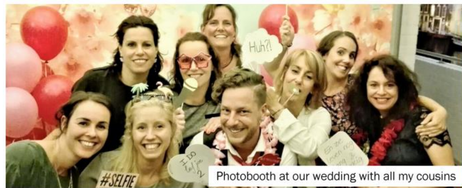
Photobooth at our wedding with all my cousins