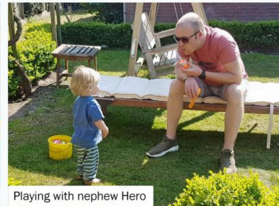
Playing with nephew Hero