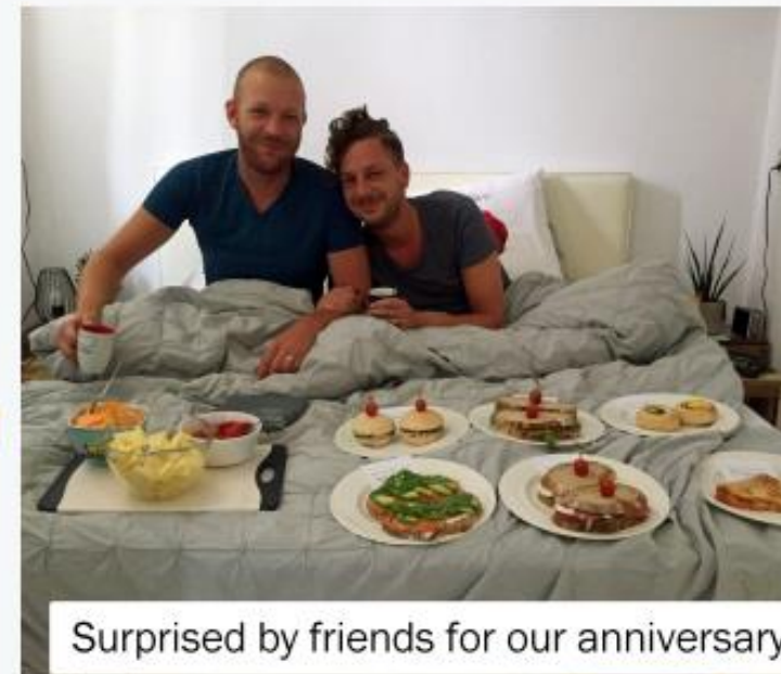
Surprised by friends for our anniversary