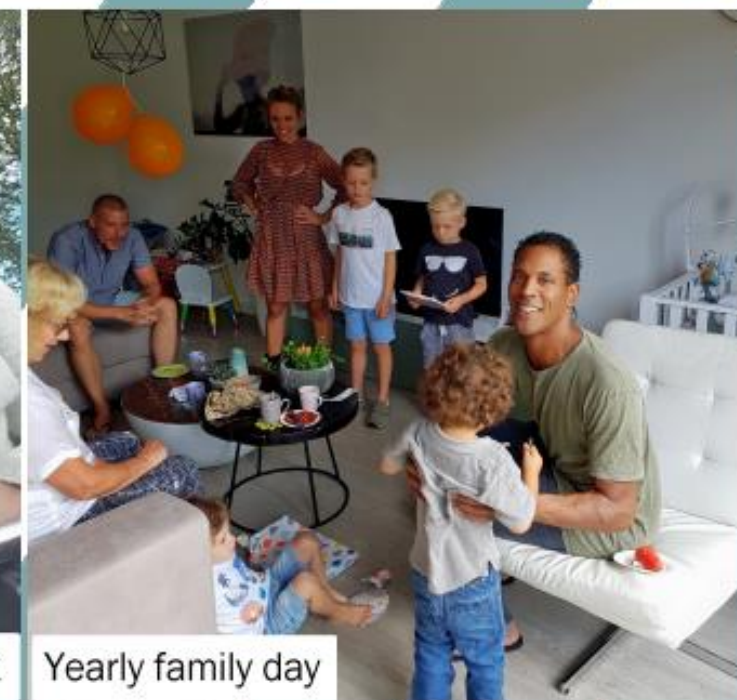
Yearly family day