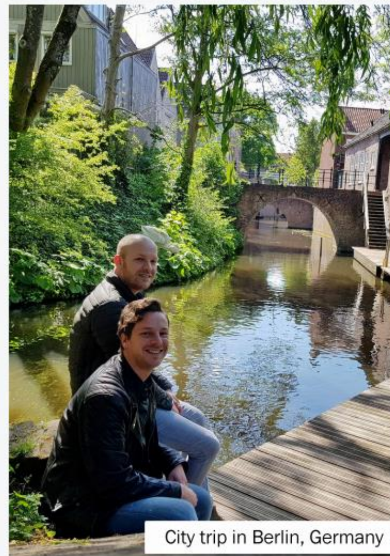
City trip in Berlin, Germany