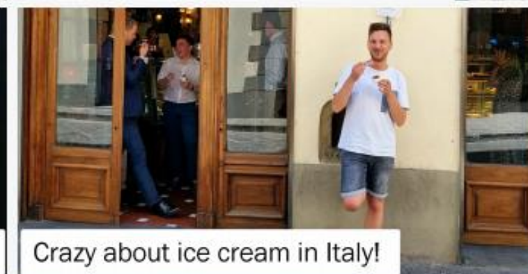
Crazy about ice cream in Italy!