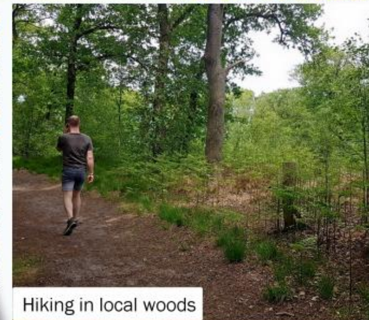
Hiking in local woods