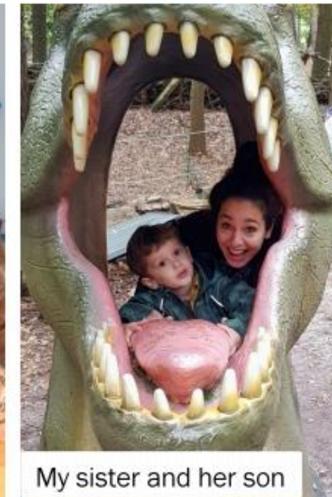
My sister and her son