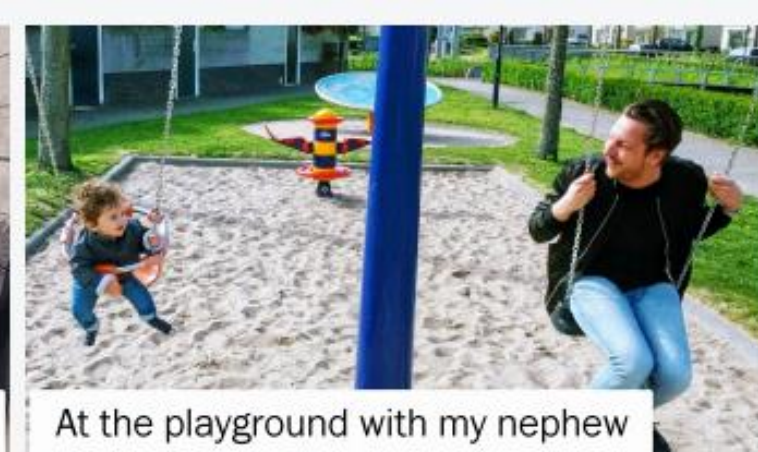
At the playground with my nephew