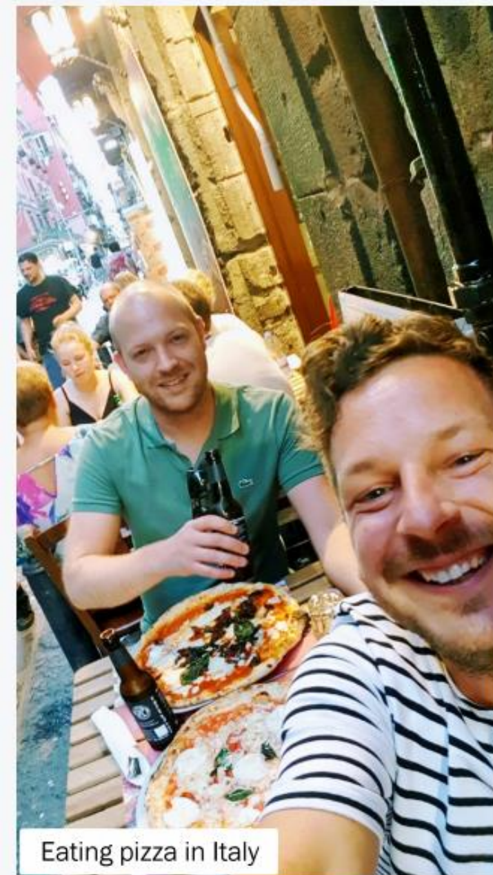
Eating pizza in Italy