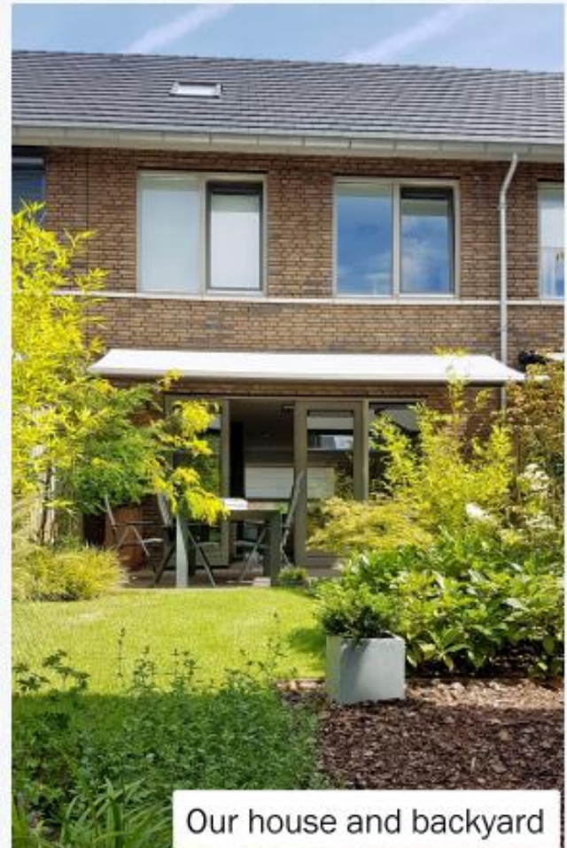
Our house and backyard

We live in a friendly village nearby a vibrant city in the south of The Netherlands; a country in the west of Europe. In our neighborhood all important facilities such as great schools and a pediatrician are nearby and it's a real family friendly community. Most of our neighbors just became parents or are expecting their first child. Each year all neighbors organize multiple activities for the kids, like a children's treasure hunt or a magic show. Lots of children play in the multiple playgrounds within walking distance, at the petting zoos or together with parents and other children in the parks. There are children and families of many different nationalities and cultures and other adopted children too.