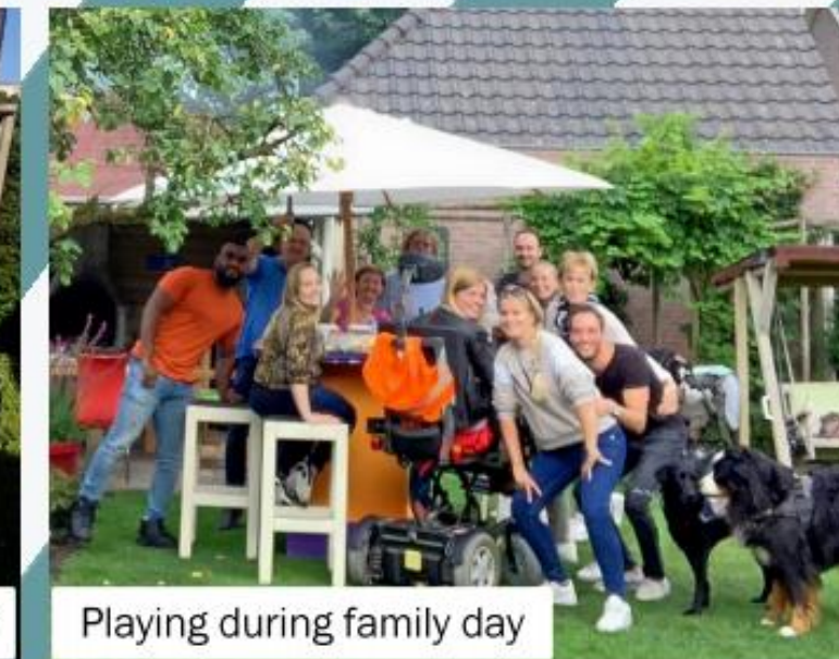
Playing during family day