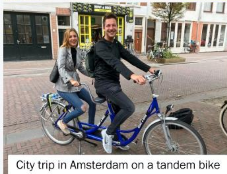
City trip in Amsterdam on a tandem bike