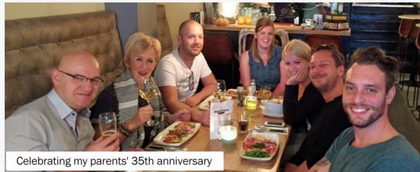
Celebrating my parents' 35th anniversary