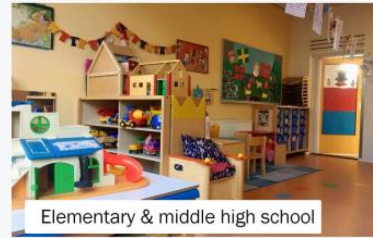
Elementary & middle high school