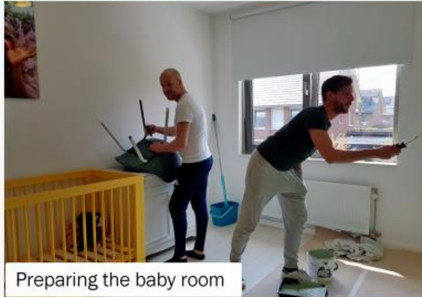
Preparing the baby room