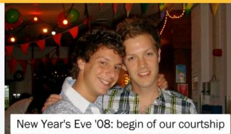
New Year's Eve '08: begin of our courtship