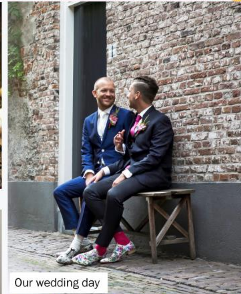
Our wedding day