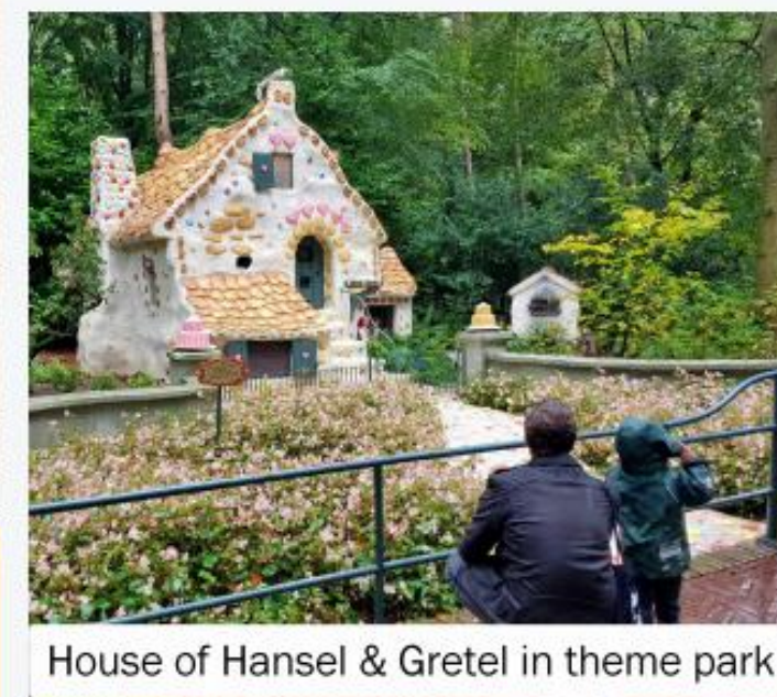
House of Hansel & Gretel in theme park