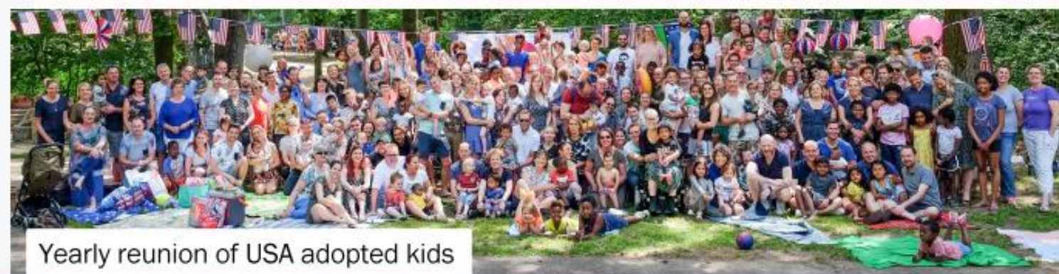
Yearly reunion of USA adopted kids