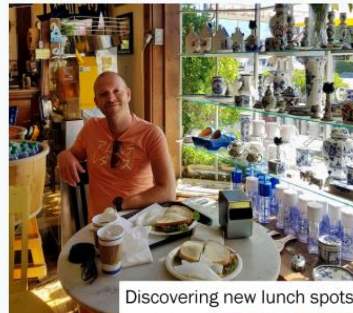
Discovering new lunch spots