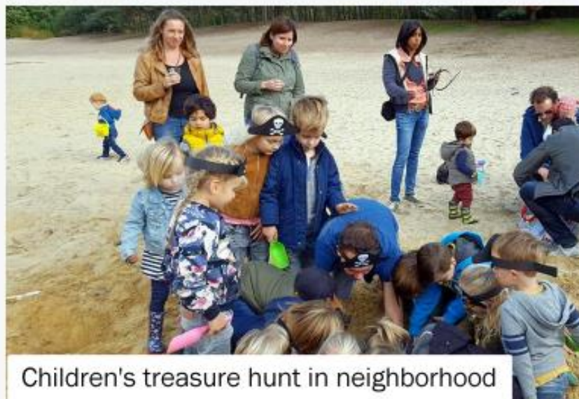
Children's treasure hunt in neighborhood