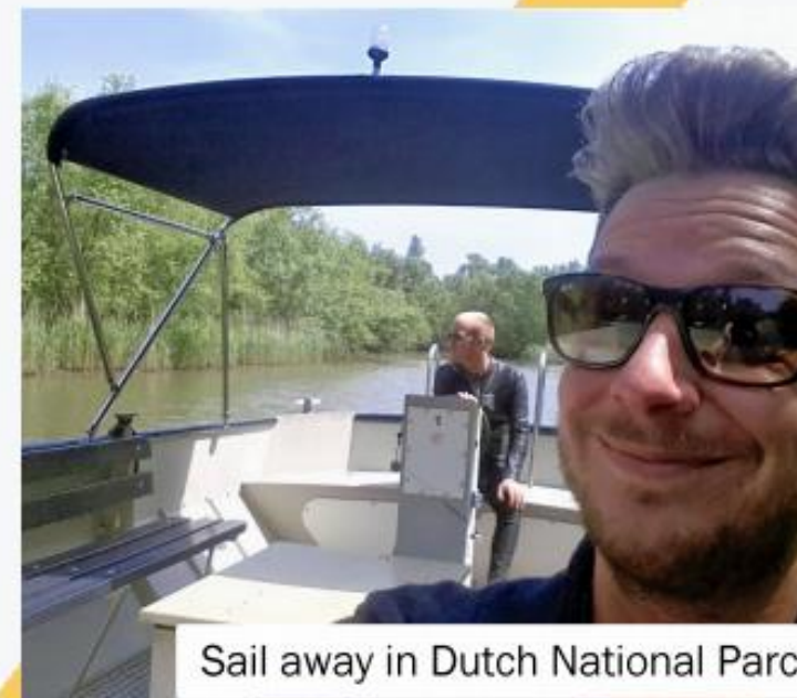
Sail away in Dutch National Parc