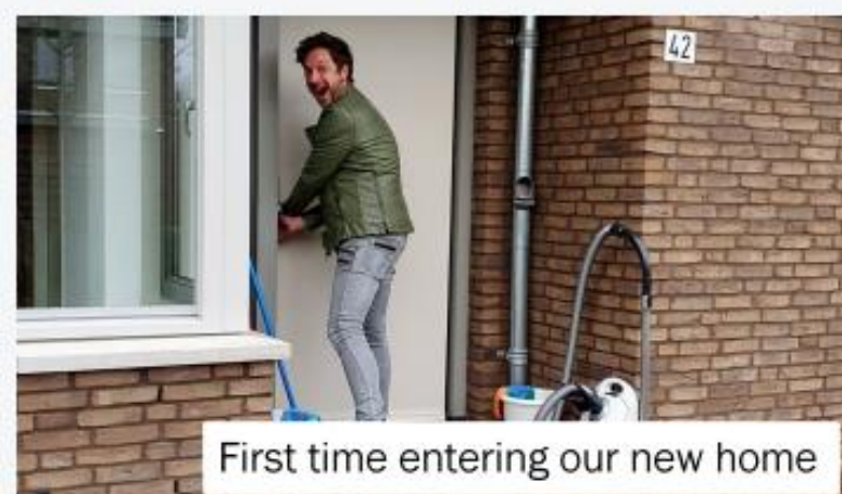
First time entering our new home