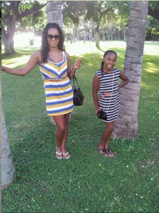
Her younger daughter with her daughter They live in Hawai at the moment