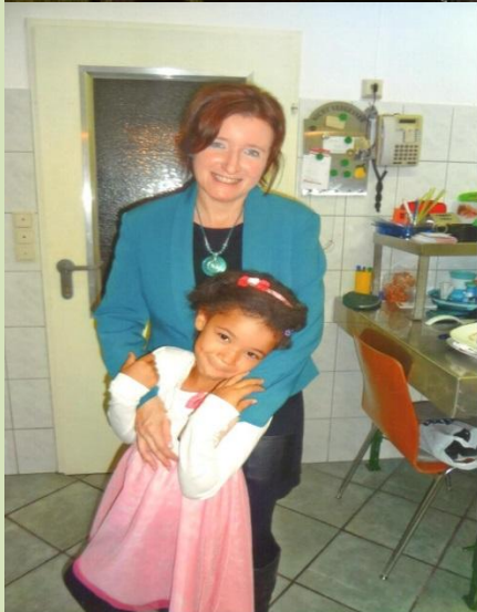
Girlfriends and their daughters