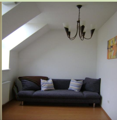
The future baby's room