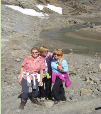
With my mom and aunt

We love nature and skiing and hiking in all different seasons.