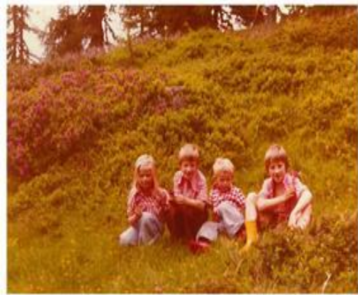
With our friends from school