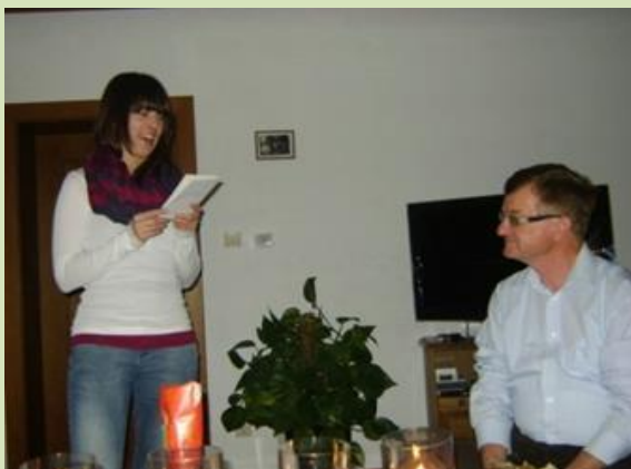
My cousin reading a poem to my father (her godfather)