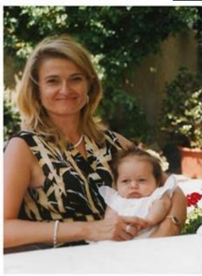
Christening of my godchild