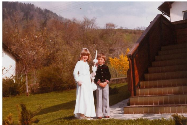
My first Communion

The village where I grew up is surrounded by mountains, and the nearby lakes attract swimmers in summer and skaters in winter. I often enjoyed skiing and with my family discovering trails for hiking tours. I still spend a lot of my spare time at my parent's house, which borders Italy and Slovenia.