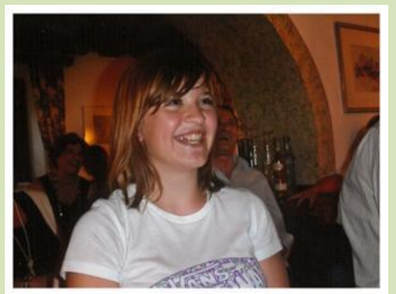
My youngest cousin who still goes to school