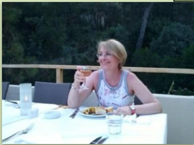
My friends from University

When I turned 18, I went to live in a bigger city to study French and Spanish at the University of Salzburg: the city where Mozart, the famous Austrian composer, was born. During my years at University I learned to live and to organize my life on my own. During my vacation I worked to earn some money for trips in Europe (Spain, France, Italy). I was always curious to explore other places, cultures, mentalities and to learn foreign languages.