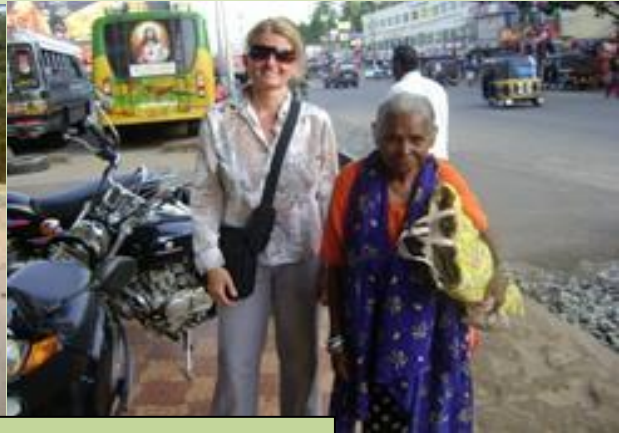
In India with my cousin enjoying city and beach