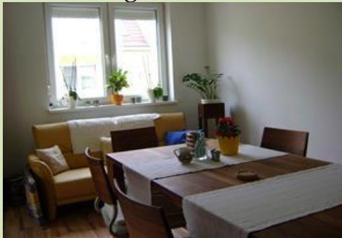
My dining room

My apartment is bright and centrally located; I can even walk to work. Nursery schools, playgrounds, schools and public transport are close by. Although the area is quiet, one can enjoy cultural & social life in the surroundings at the same time. I have a big dining room, a kitchen, a living room, a bed room and a special room for your baby. I hope that you consider me as the adoptive mother for your soon to be born baby so I can begin to decorate the room for your baby.