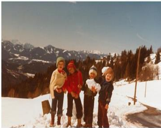
With our cousins