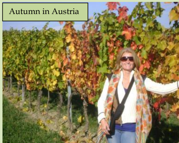
Autumn in Austria