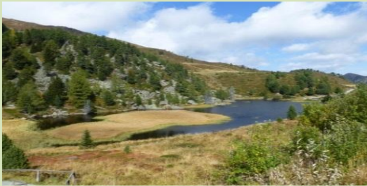
National Park "Nockberge"