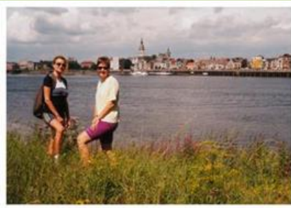
My friends from Brussels

I had an interesting job at the European Commission where I enjoyed the international environment with colleagues from all over Europe. During these years between 1999 and 2003 I also travelled a lot for work, but only within Europe (for example to Barcelona, Athens, Rome). Unfortunately there was no opportunity for me to travel to the United States.