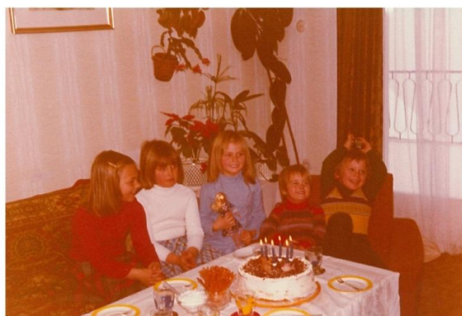
My brother's birthday