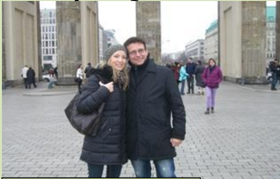
My brother with his girl-friend