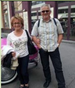
My aunt and uncle visiting me in Vienna

My father has 3 brothers & sisters and my mother has 5 brothers & sisters. Therefore I also have a lot of aunts, uncles and cousins. I have regular contact with them and we visit each other when possible. Most of my family members I meet regularly at family events near my home. Traditions like Christmas, Easter and birthdays have a big importance in our family.