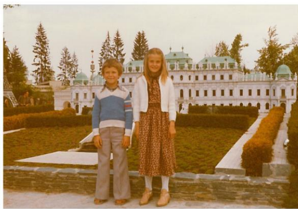
My brother and me

I am the oldest child of two from a loving family. I grew up in the southernmost part of Austria and had a happy childhood. Playing and exploring nature, and having a healthy social environment were of utmost importance while growing up.