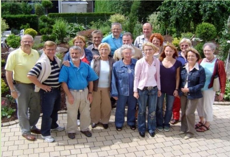
Family event in Germany

My father has 3 brothers & sisters and my mother has 5 brothers & sisters. Therefore I also have a lot of aunts, uncles and cousins. I have regular contact with them and we visit each other when possible. Most of my family members I meet regularly at family events near my home. Traditions like Christmas, Easter and birthdays have a big importance in our family.