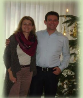
With my brother at Christmas