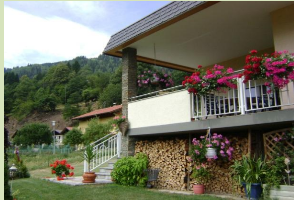
Located in the south of Austria in a small town