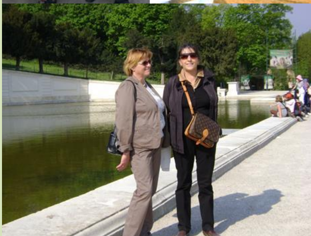
My mother and my godmother visiting me in Vienna