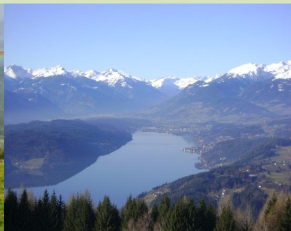
Lake "Millstätter See", Carinthia

Austria's landscape is diverse. Many regions are well known by tourists from all over the world.