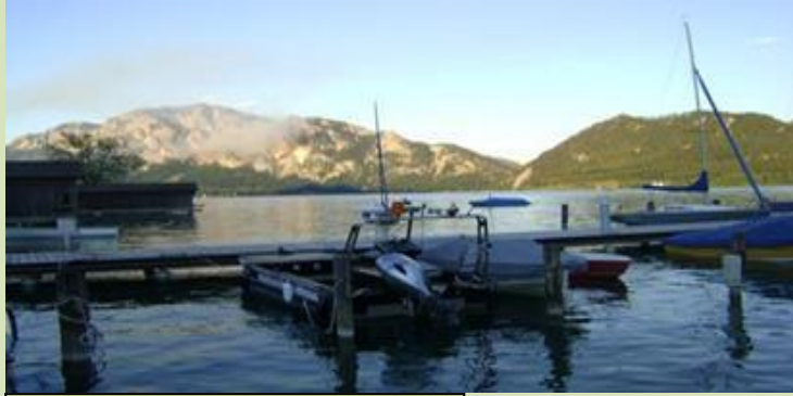
Lake "Attersee", Upper Austria