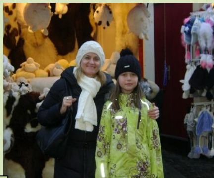
With my godchild