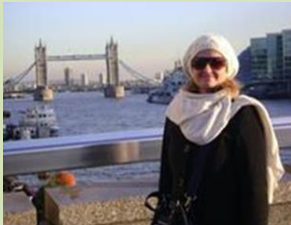
For work in London

I have worked hard and I have achieved a lot in my life. Now, there is time for a change. I have a stable career and my income allows me to live a comfortable life. I have always dreamed of becoming a parent and can't wait to spend time with your child - discovering the world together!