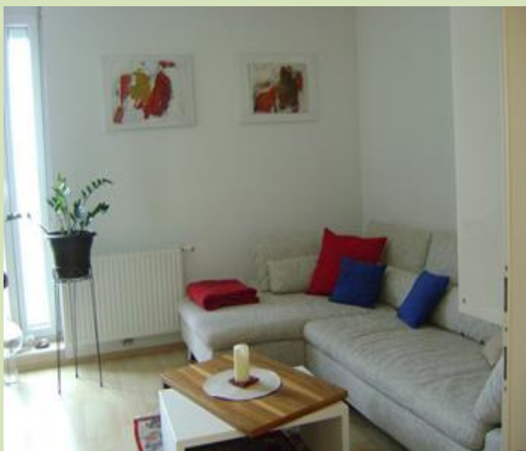
My living room