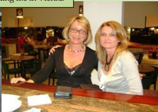
My aunt and me on holiday