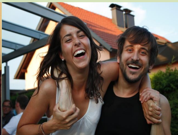
Sister & brother