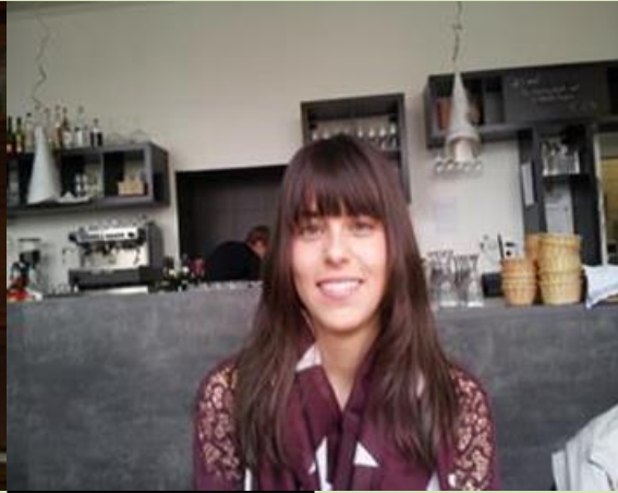
My sporty cousin