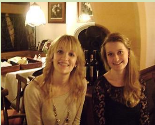
Two cousins studying