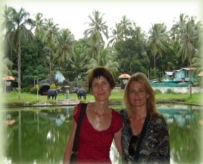
With my cousin in India