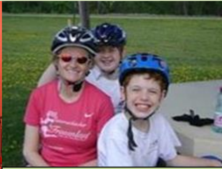
Bike-tour with the boys of a friend