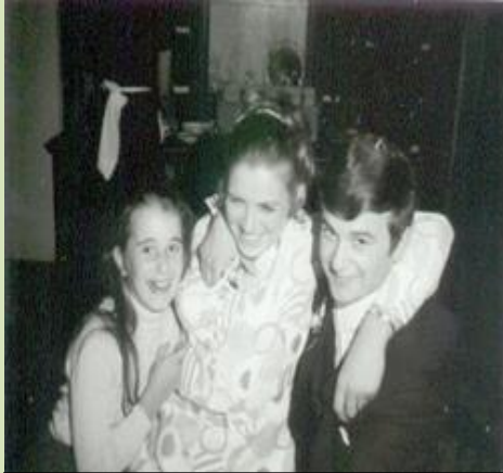
My parents and the sister of my dad