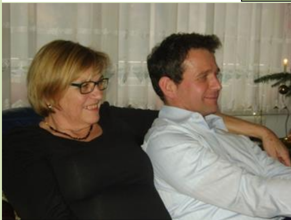
My mom and my brother