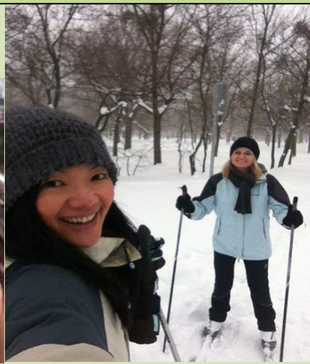
Cross-country & skiing with girlfriends