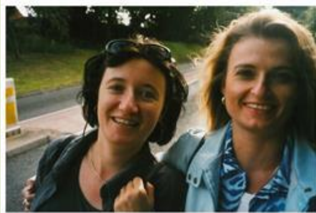
We shared a small apartment those days