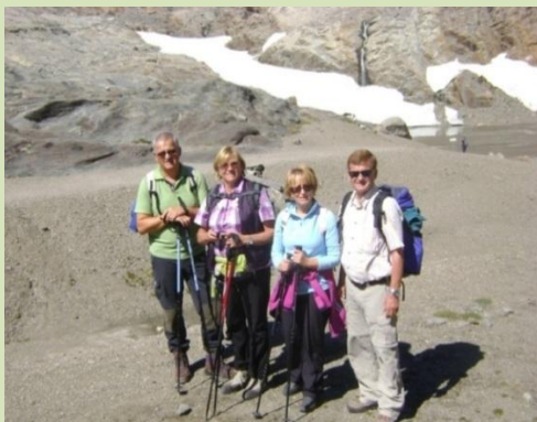
With my parents & aunt and uncle