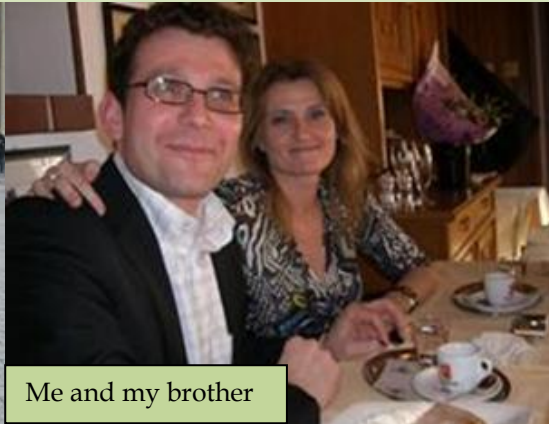
Me and my brother