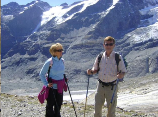
My dad and his sister