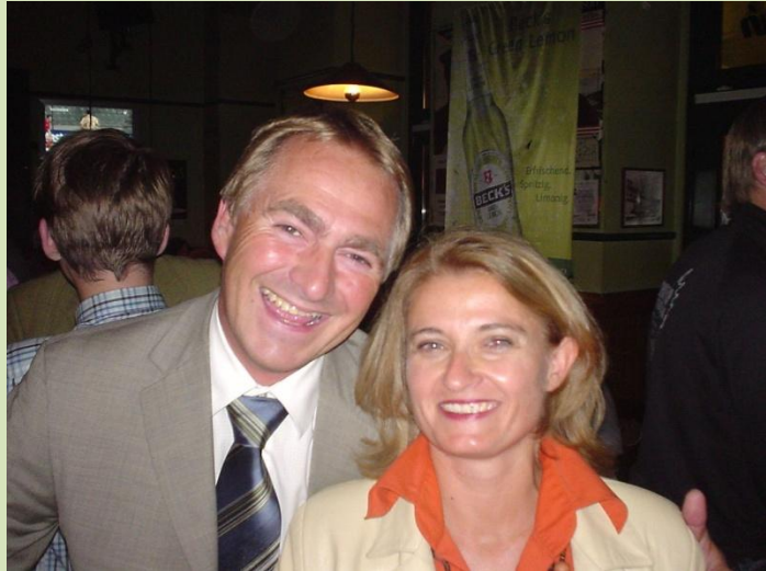
With my long - standing male friend

I am confident that while I am living without a partner at the moment, male contact will still be very important for your child. I am glad that I also have good relationships with the partners of my friends and colleagues. Of course my father and brother will also play an important role in the education of your child.