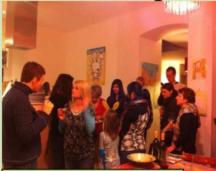
Gathering at the house of a friend