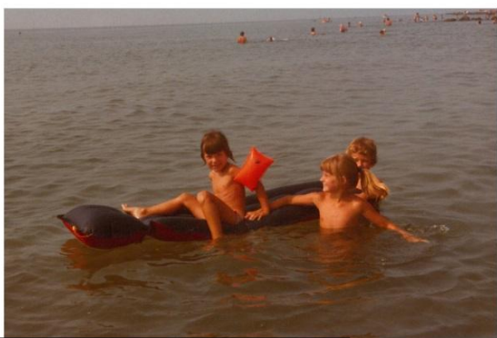
At the Adriatic Coast, Italy