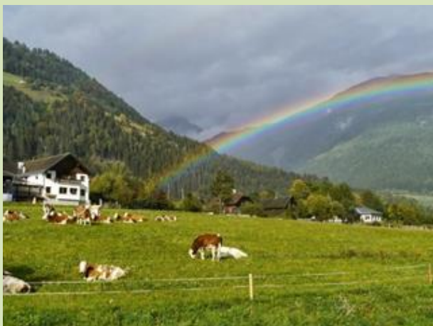
What a fantastic rainbow!