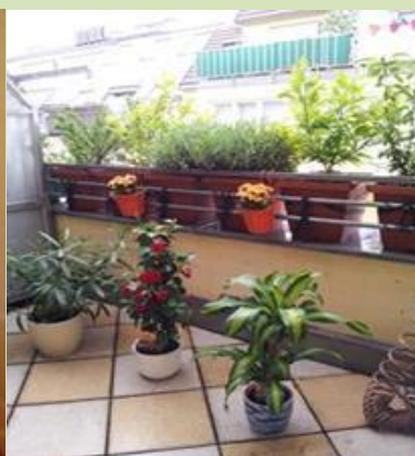
My balcony to the courtyard