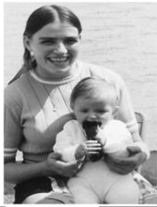
My mom and me