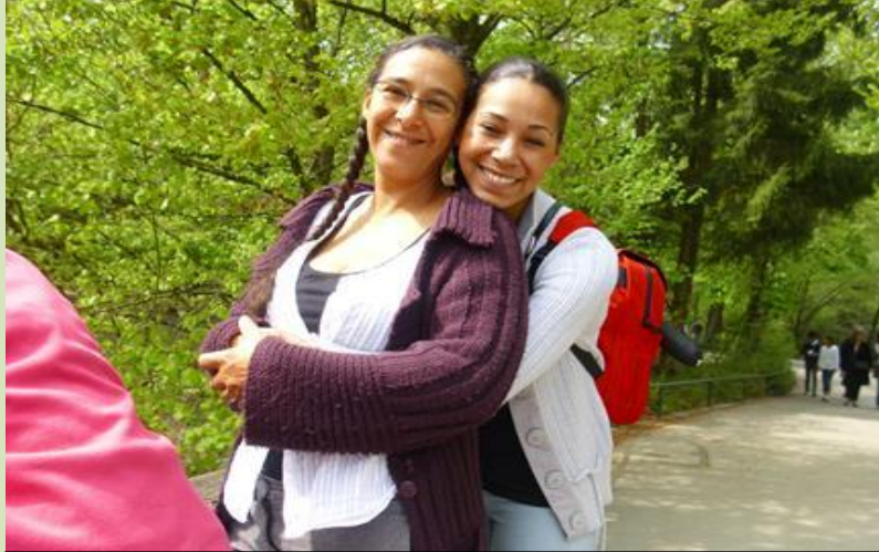
My second cousin and her elder daughter who also has a baby meanwhile

Although we couldn't meet often in the last years, I hope we will see each other more often in the future and I am sure everybody will be happy to welcome a new family member with American roots.