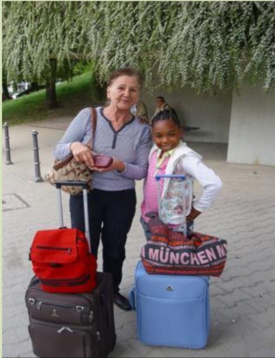
My father's cousin and one of her grandchildren

My father's cousin lives in southern Germany and has three children. Her eldest daughter, who is around my age, is of mixed race and will be a great support system to both your child and me. I am lucky enough to be surrounded by family members of many different cultural and ethnic backgrounds, and I can't wait to be able to share this with your child as well.