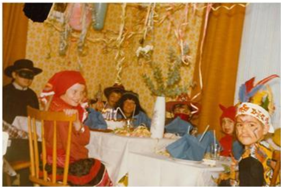
My birthday in February

During summer break, we often went on vacation for a few days. Most of the time our destination was the northern part of Italy, because it is not far away and as children we especially loved to go to the seaside.