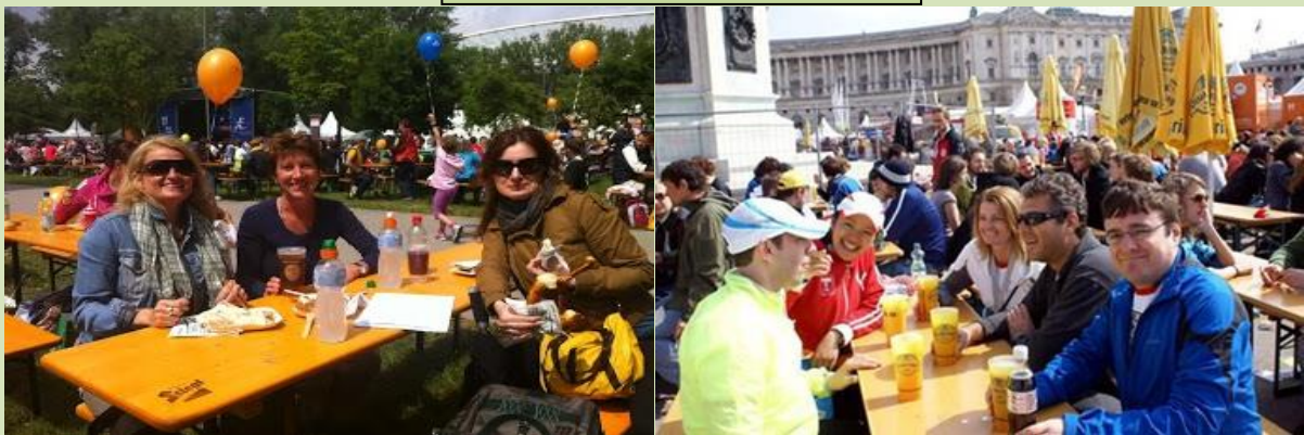
Sportive activities and socialising

I am confident that while I am living without a partner at the moment, male contact will still be very important for your child. I am glad that I also have good relationships with the partners of my friends and colleagues. Of course my father and brother will also play an important role in the education of your child.