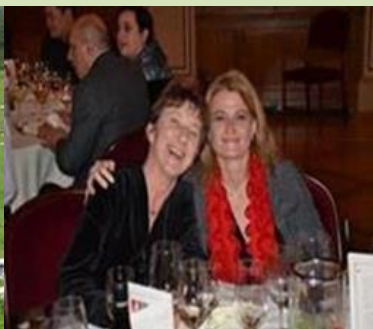
Dinner in Vienna