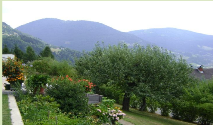
My mother's lovely garden, surrounded by mountains