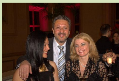
Christmas in Vienna with colleagues