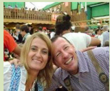
With friends in summer & winter