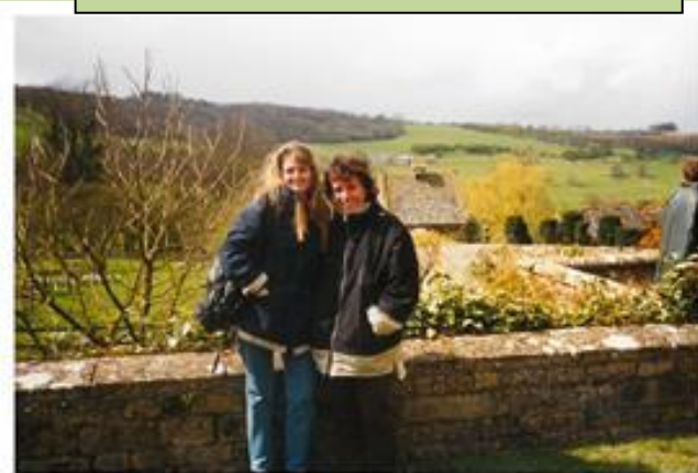
My friend who lives in the United Kingdom today

Most of my longest friendships date back to this time. Today we all live in different places, making it difficult to meet each other that often, but we do regularly speak to each other on the phone or by e-mail.