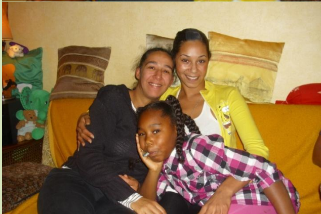
Her eldest daughter, younger daughter and grandchild