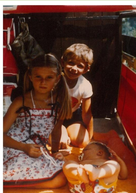
Me and my brother with the baby of guests at the guesthouse of my grandmother