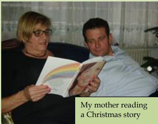
My mother reading a Christmas story

And as traditions (Christmas, Easter, birthdays) in our family are cultivated, regular family gatherings will continue to take place.