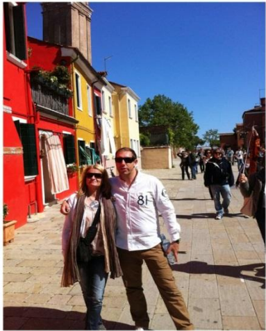
With the boyfriend of a girlfriend