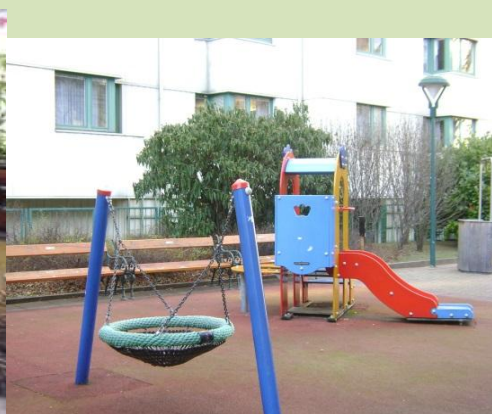
A nearby playground