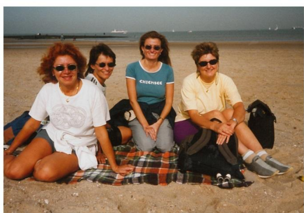
At the Belgian Seaside