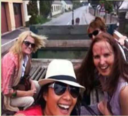
Riding on a tractor