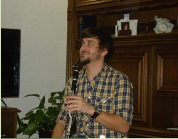
My musical cousin