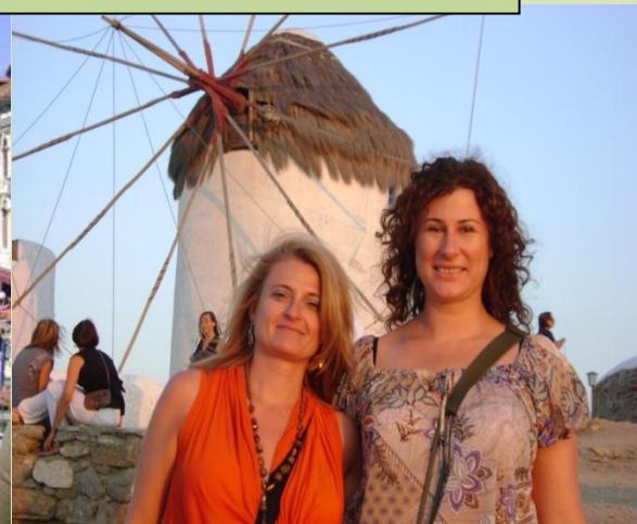
Mediterranean flair in Italy and Greece

I especially adore countries in the Third World because it's there where I always had the feeling to be brought back to my basics. People are so warm-hearted and family-oriented – that's what seems important to me in life! So far I haven't travelled to the US but I would love to do so soon. Once your child is big enough I long to explore their home country, and visit with you if you like, and other regions in the world together.