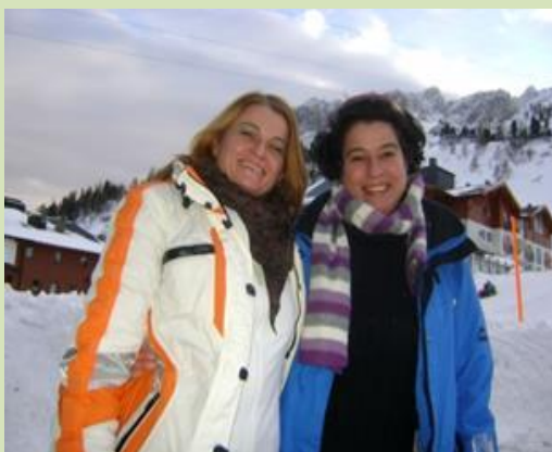
With my friend from high school