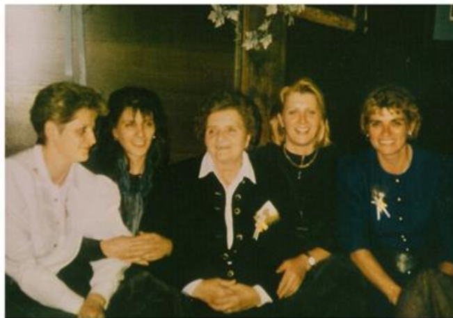
My grandmother, my mother & her sisters in former times