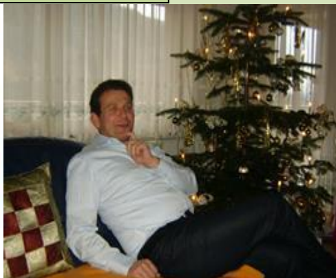
My brother at Christmas