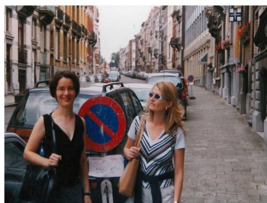
City life in Brussels