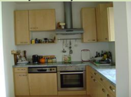
My well-equipped kitchen