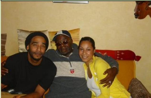
Her two younger children and their father