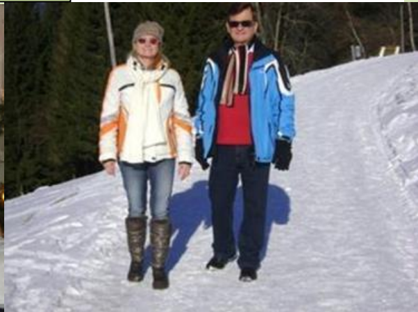
Me and my dad