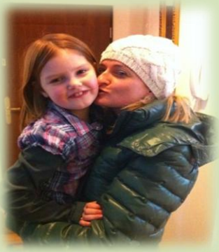
The daughter of a friend

I chose to adopt from the United States, because I am inspired by your very diverse and interesting country. I am open to adopting a child of any race. As a child I was fascinated by foreign cultures, religions and mentalities.