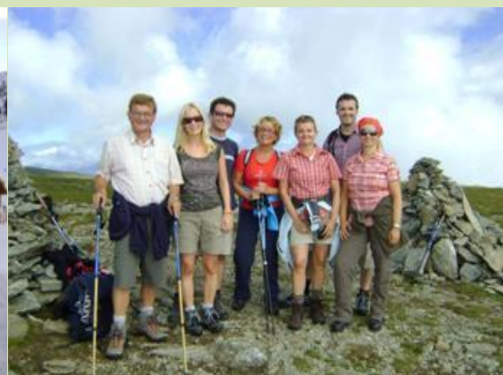
With my father, aunt, brother, his girlfriend and friends