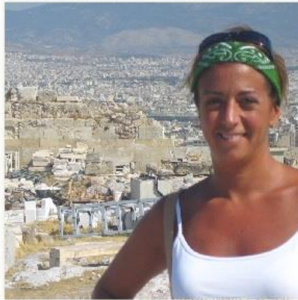
At the Ruins in Athens, Greece