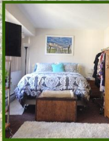
Future Baby's Room