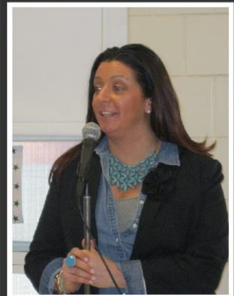
Giving a Parent Workshop at school.