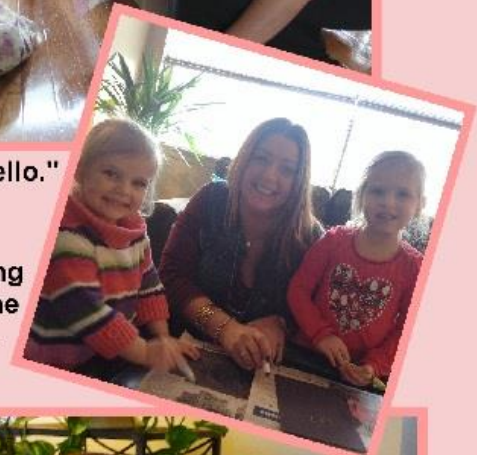
Coloring with the girls.