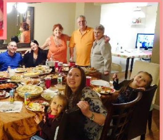
The family at the Thanksgiving table.