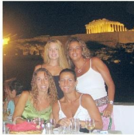
The girls dining in Athens, Greece and the Parthenon as a back drop!