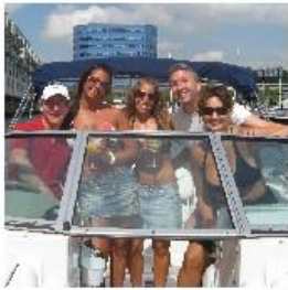
Good friends heading out for a sunny boating day.

Spending many warm and sunny days cruising the Hudson River on a boat is something I am blessed to enjoy. My friends own boats and so this has become a part of my summer life. Boat rides are a great way to gather friends and family for a fun filled beautiful day.