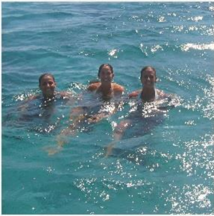
Swimming in the Aegean Sea in spectacular Greece.