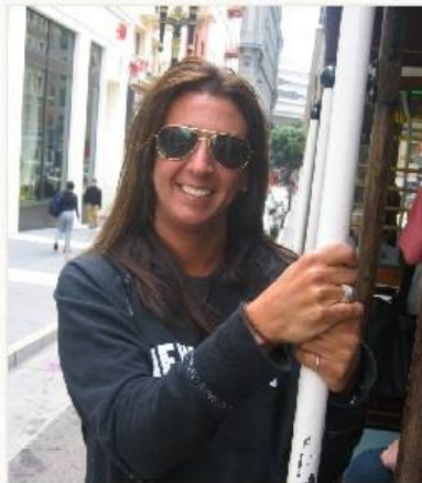
Getting around San Francisco by trolley.

My passion for traveling and discovering the world is something that I am fortunate to do.