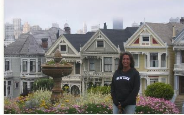
In San Francisco standing in front of the Pink Ladies Victorian homes built in the early 1800's.