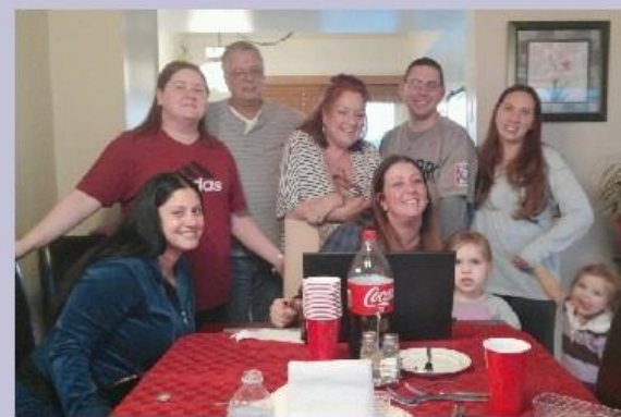
A typical Sunday gathering.