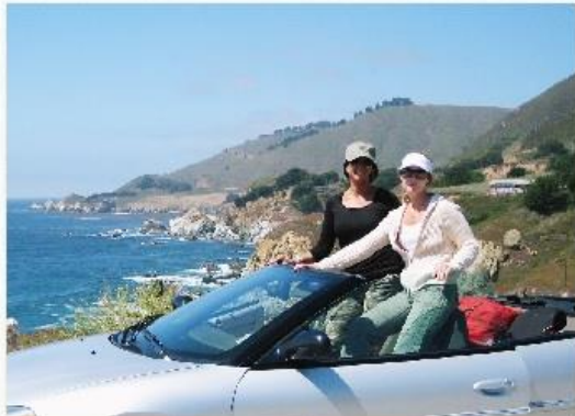
Cruising down the Pacific Coast Highway