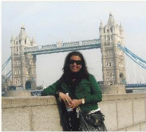
Tower Bridge in London, England