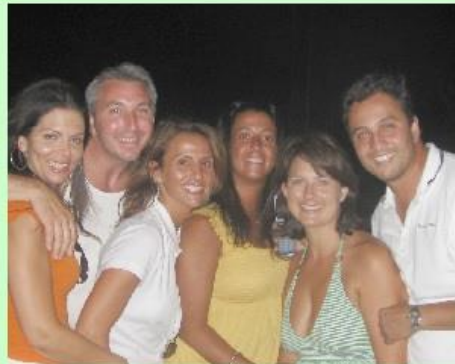
The gang vacationing in the Bahamas.