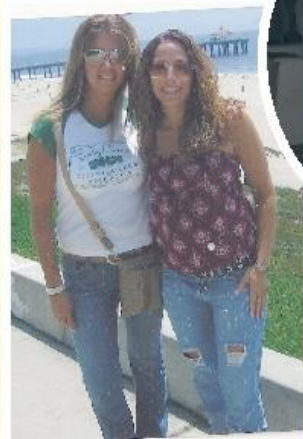
Me & Ivy in Newport Beach, California.