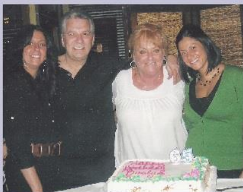
A Surprise Birthday Party for Mom!