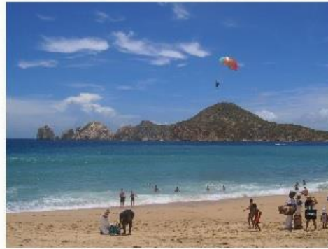
I went parasailing in Cabo San Lucas, Mexico. Thrilling!