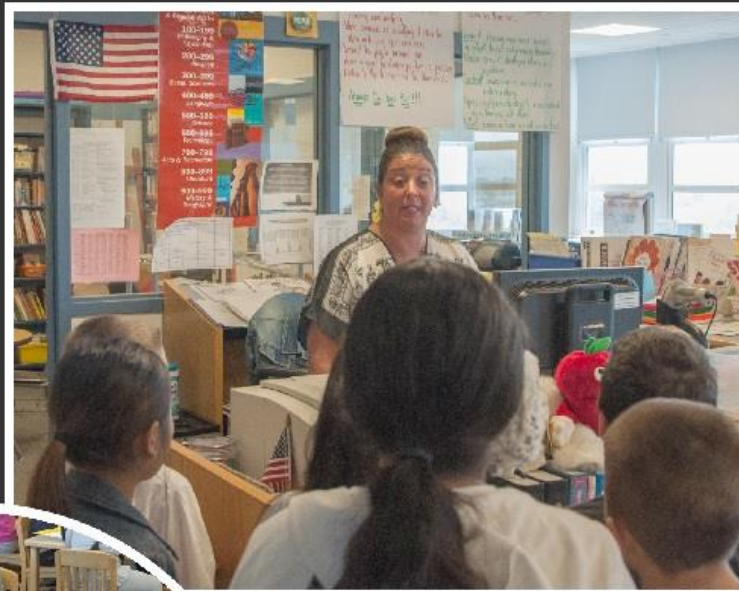
It's Check Out time in the Library!