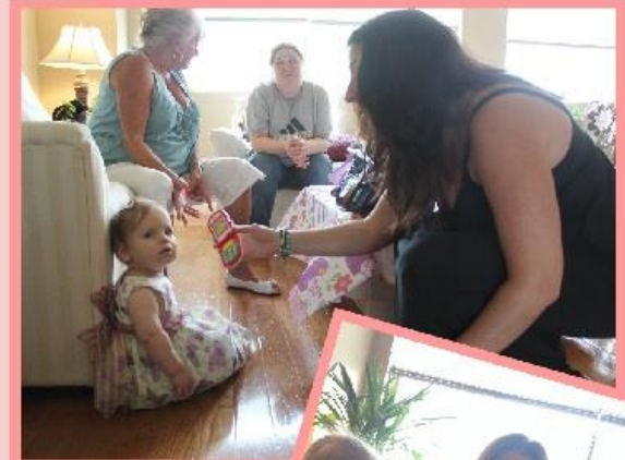
"Ring, ring. Hello."