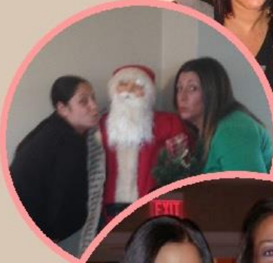
We're kissing Santa!