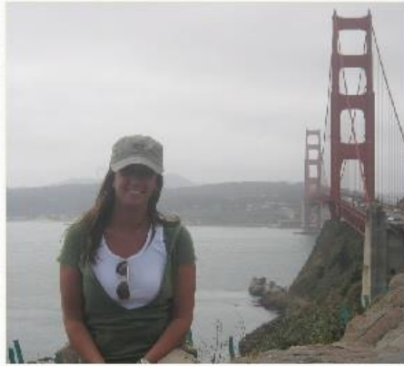
Golden Gate Bridge, California