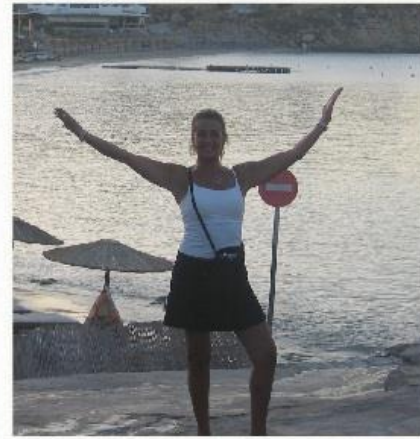
Experiencing the beautiful sunrise in Mykonos.