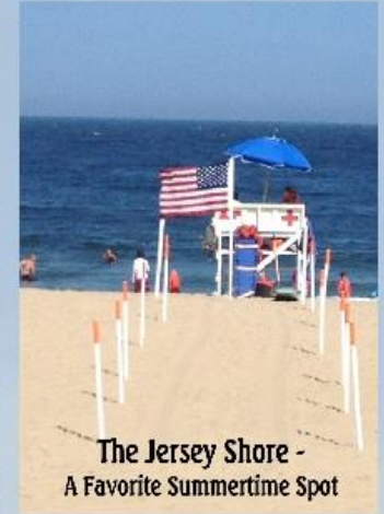
The Jersey Shore - A Favorite Summertime Spot