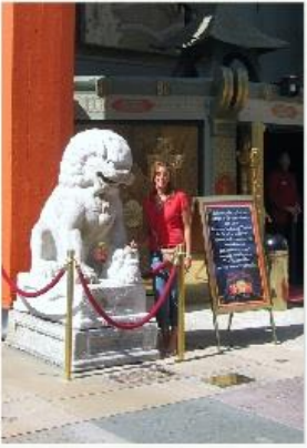
Mann's Chinese Theater. Hollywood, California