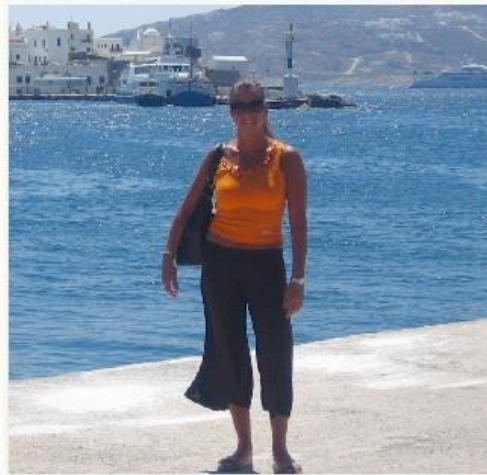
At the port in Mykonos waiting for the ferry to Crete.