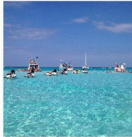
A day of jet skiing in Turks and Caicos.