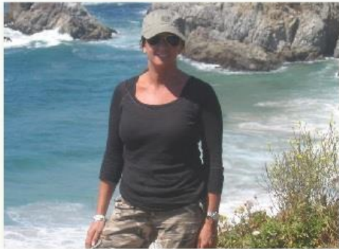
Walking the shoreline in Santa Barbara, California.