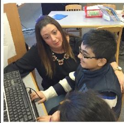
Showing my students technology is a great way to get information.