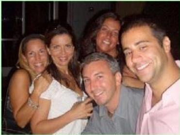
A night out with great friends.