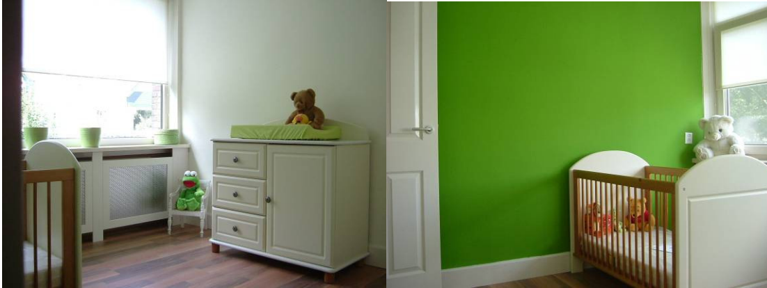
Bedroom for the baby

We have several friends that also adopted their children. There is a couple in our circle of friends that adopted their two children from the USA. The oldest is a bi-racial boy; he's very spontaneous and fun to be with. When we are there, he wants to be with us continuously and wants to play with us all of the time. The youngest is a Caucasian girl. She is still a bit shy, but very sweet. The smile she has is so lovely that it hits you right in the heart.