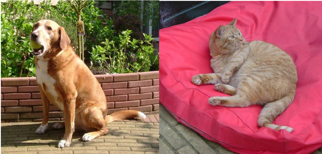
Our dog Max and cat Balou

In our neighborhood people greet each other, while passing by.