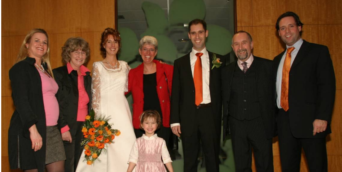
Family picture at our wedding.