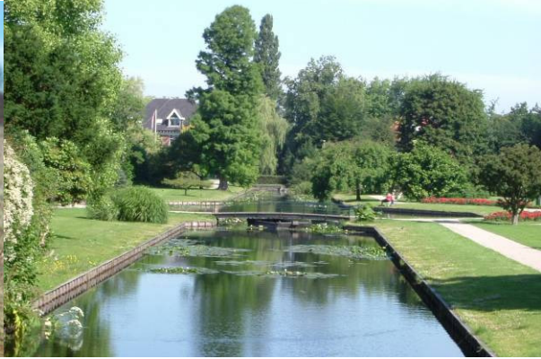
small park 5 minutes from our house

The Netherlands is a safe country to live in. This makes the Netherlands a great place to live and raise children.