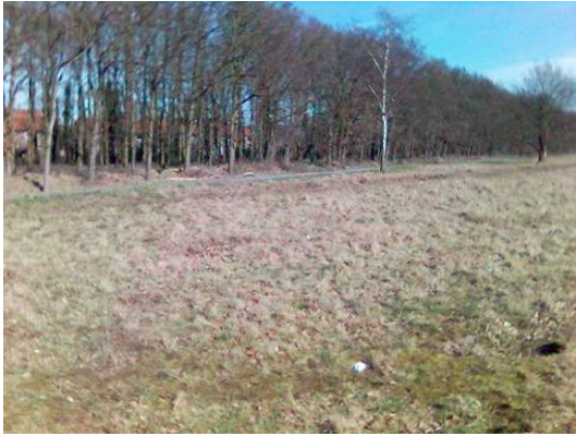
Nature Park near our house

The Netherlands is a small country in Europe. In the Netherlands, there is a lot of room and respect for variations in thoughts, religion, background and ethnic origin. Because of this there are a lot of biracial people around us. That's why we chose to adopt from America. This is because we see people how they are, not what they look like. We find America a beautiful country and accessible for us to visit often.