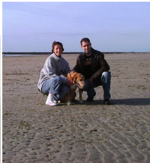
A winter walk on the beach in Holland