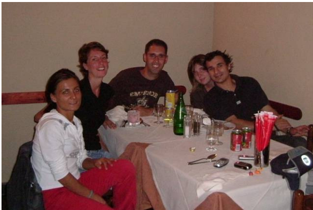
Dinner with our Italian friends in Italy