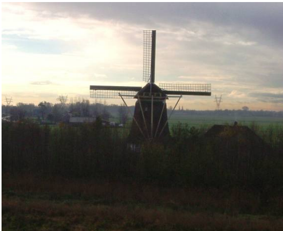
Authentic windmill in a pasture near our city

Some times we go to the beach and take long walks with Colin, Max and friends. In the winter we drink hot chocolate to get warm from the cold wind.