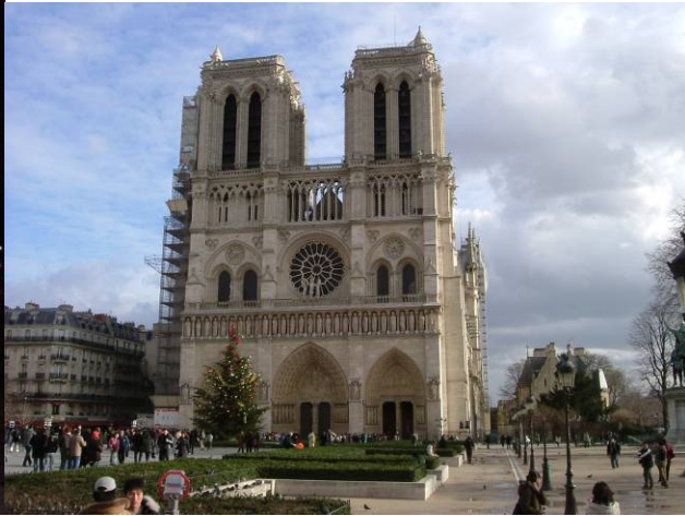
Honeymoon in Paris

We like to spend our holidays in Italy. We usually go to the north of Italy because we find that the most beautiful part of the country. Mostly we go camping near a big lake where it's great to swim and relax in the sun. Sometimes we go together and other times we go with friends. If we go with friends who have children, we stay on a camping ground which is perfect for children. Where it's safe and has a lot of room for children to play.