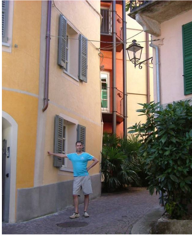
Holiday in Italy