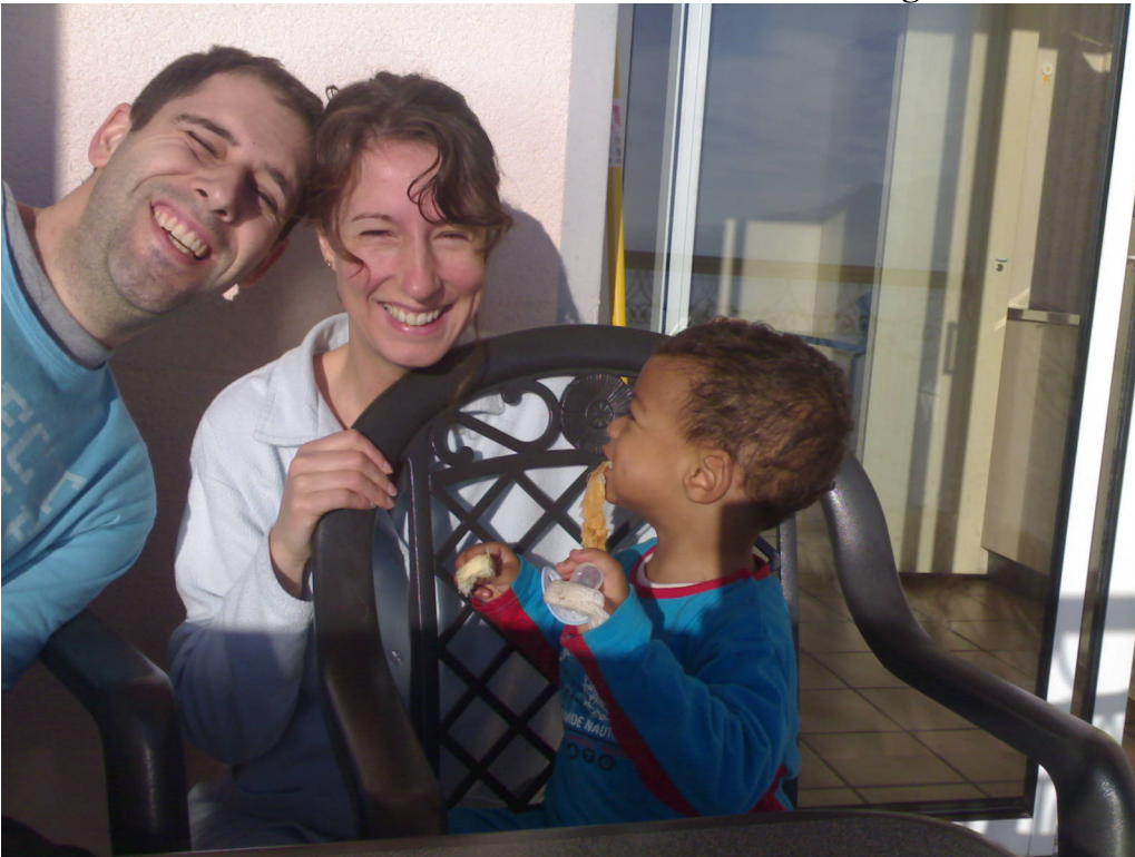
Breakfast in Italy