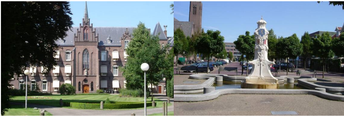
Monastery in the center of our city