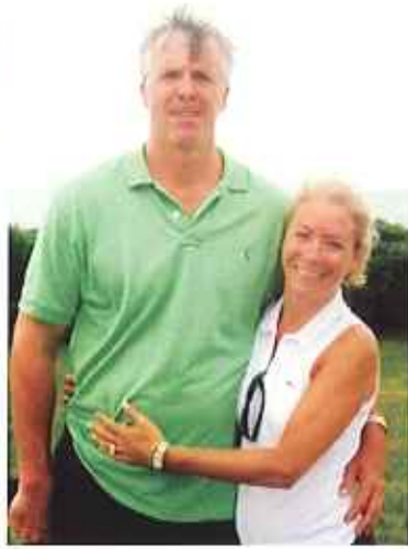
Enjoying the scenery after hiking through Marthas Vineyard