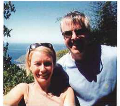
a day exploring the island of St. Lucia