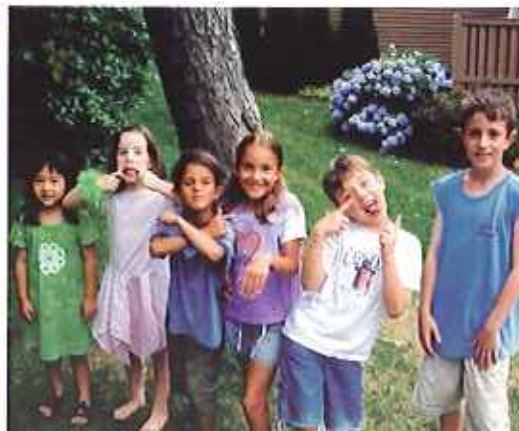
The kids "playing" together in Cape Cod