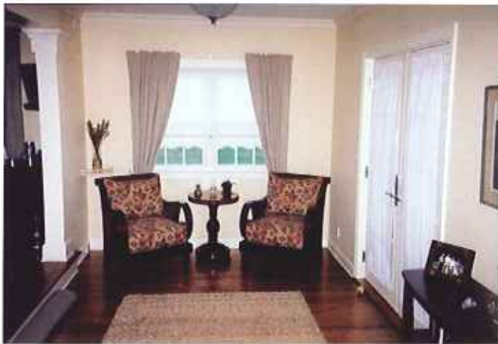
Our sun room in our home