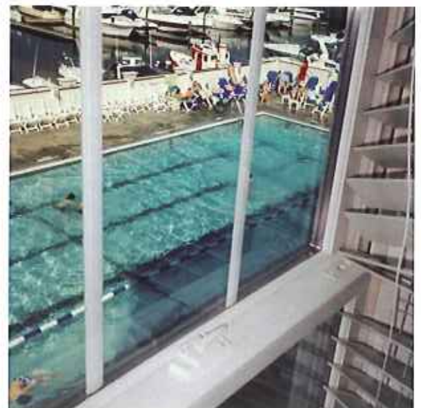
The pool at our boat club