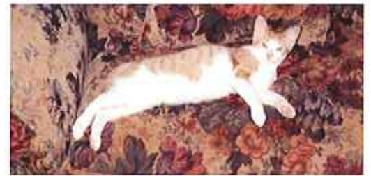
The newest addition to our family - Charlie

Riley is one of the friendliest dogs and has provided us great companionship and comfort. We also have a kitten, Charlie, who is the newest addition to our family. The incredible, amicable interaction between Charlie and Riley, is something to behold...they have become the best of friends.