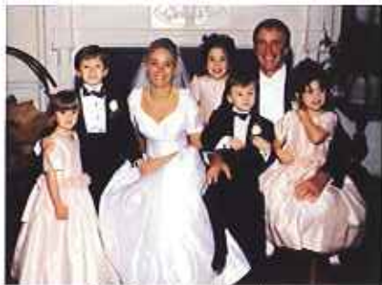
Our nieces and nephews

met, we hope that you will decide that we will be the parents for your newborn child. In our struggle to conceive, we have experienced many emotions such as disbelief and sadness. However, we have continued to maintain our hopes and dreams that someday we will have a family. We hope you will be the answer to our prayers.