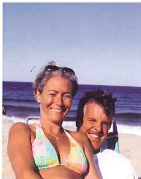
Enjoying a day on the beach