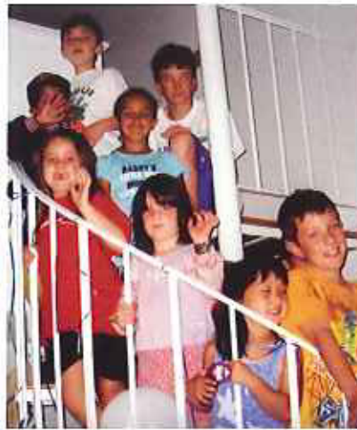
The kids in Cape Cod

We are a very close family and enjoy spending time together. We especially love spending the holidays with everyone. We experience great joy and pleasure watching all of the children opening up the presents at Christmas time, hunting for Easter Egg in our back yard at the annual 'Easter egg hunt' and carving jack-o-lanterns at our annual