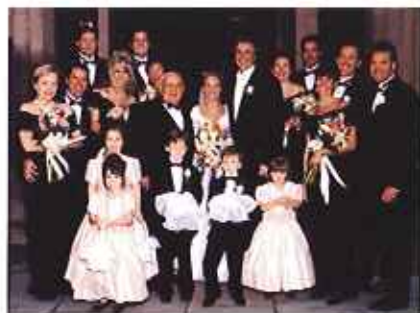
Our Wedding Party "Oh Happy Group"

We are a fun loving couple that has been married for almost ten years. A most complete and joyous celebration of our tenth wedding anniversary would be to adopt and embrace a child into our lives. After years of unsuccessful infertility treatments, we have decided to begin our family through adoption. By adopting, we will have the potential to finally make our lives complete. Although we have not yet