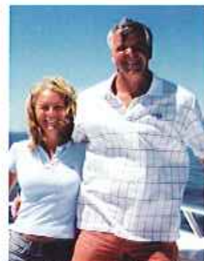
Enjoying a boat ride to Martha's Vineyard

would love to watch the family grow, when we are blessed and chosen to provide a loving and safe home for your child.