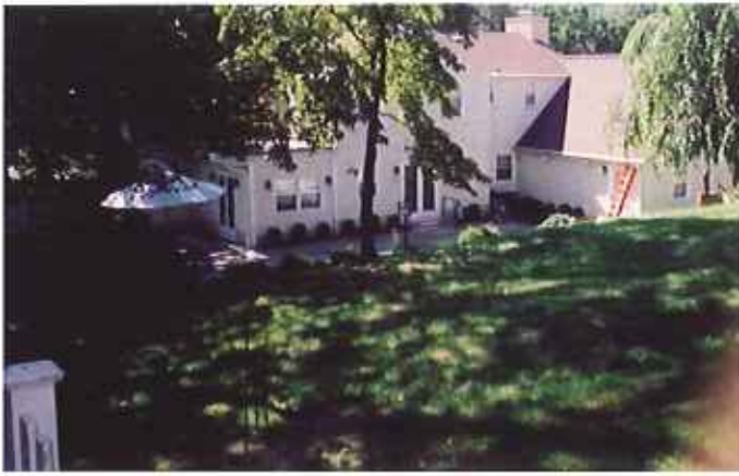
Our back yard