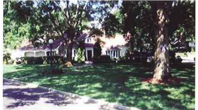
Our house in the summer

Our home is located in a suburb approximately 30 minutes outside of the city. We have resided in this area for the last six years and in our current home since August, 2006. We look forward to spending the rest of our lives here, while also providing a loving home for your child. Our house, which is a beautifully detailed Tudor home with four bedrooms and three baths, is only minutes away from the award winning school our child would attend. The interior of our home has