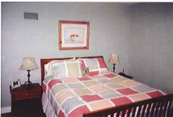
One of our guest rooms

a roomy, cozy feel to it. The baby's room is upstairs, next to the master bedroom and has lots of bookcases, windows and ample space for baby furniture as well as a play area. The house is warm in the winter and cool in the summer, with lots of windows to look out at the beautiful scenery. In addition, we also have a spacious family room, which opens up to our beautiful back yard. The backyard is something to behold. The lower yard has a large patio area as well as a large yard for the children to play and the upper yard is not only beautifully landscaped, but has a large grass expanse, also great for playing. We love using this area of our home for barbecues and other entertaining with our families and neighbors. Everything needed can be found very close by, i.e. Shopping, the train, movies, museums, etc... Among other attributes, our home and surrounding areas make it the perfect place to raise a family. We live in a beautiful place that would be made much more beautiful with the addition of a child. Our home is an exciting place to be and to think about a child being part of this excitement is something we would cherish for a lifetime. Mostly, we would like you to know that we consider ourselves best friends and know that we will make wonderful, loving, and nurturing parents. The relationships we have with all of our nieces, nephews, and Godchildren, are evidence of that.