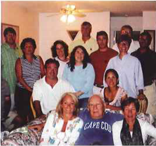
The adults in Cape Cod