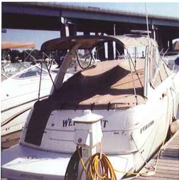
Our boat "Well Spent"