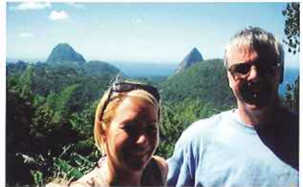
A tour through the mountains of St. Lucia

We are a young energetic couple that thoroughly enjoys our time together. We are fortunate enough to own a boat that provides comfort, as well as an escape from the everyday. Our boat has plenty of amenities and sleeping space, which allows us to enjoy the beauty of the water and a world of possibilities. Safety and responsibility are two factors that are never left out. The marina where we keep our boat provides such amenities as an Olympic size swimming pool, a four star restaurant, a top-notch fitness center, as well as access to other water sports. We enjoy whatever time we can, packing a bag along with our golden retriever, Riley, and head out on the boat.