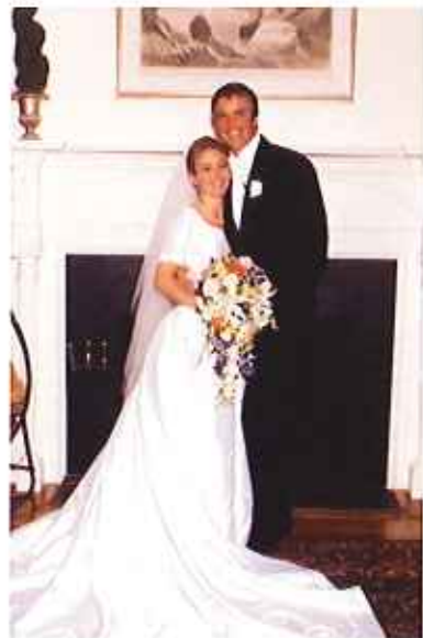
Our Wedding Day 1997