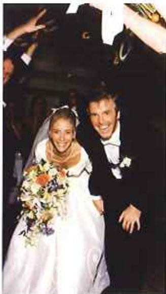
The beginning of a beautiful life.