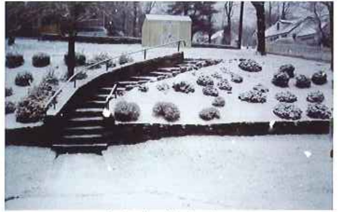
Our back yard in the winter