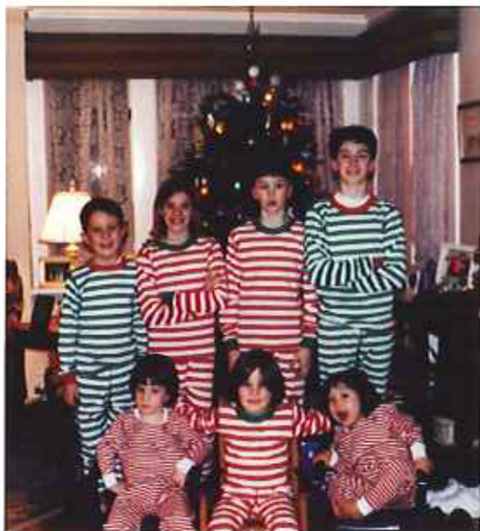
Our Christmas morning

We are a very close family and enjoy spending time together. We especially love spending the holidays with everyone. We experience great joy and pleasure watching all of the children opening up the presents at Christmas time, hunting for Easter Egg in our back yard at the annual 'Easter egg hunt' and carving jack-o-lanterns at our annual