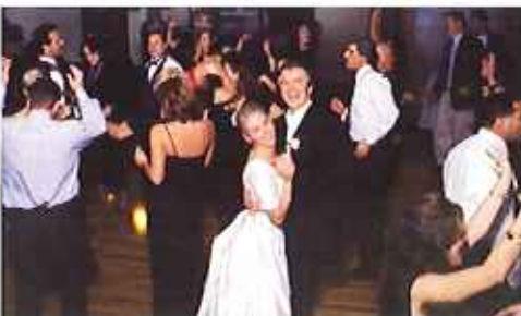
Enjoying our first hours together as husband and wife