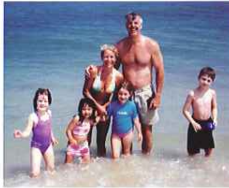
On the beach at Cape Cod with our nieces and nephews