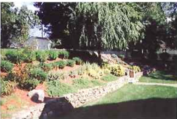
Our back yard in the summer

a roomy, cozy feel to it. The baby's room is upstairs, next to the master bedroom and has lots of bookcases, windows and ample space for baby furniture as well as a play area. The house is warm in the winter and cool in the summer, with lots of windows to look out at the beautiful scenery. In addition, we also have a spacious family room, which opens up to our beautiful back yard. The backyard is something to behold. The lower yard has a large patio area as well as a large yard for the children to play and the upper yard is not only beautifully landscaped, but has a large grass expanse, also great for playing. We love using this area of our home for barbecues and other entertaining with our families and neighbors. Everything needed can be found very close by, i.e. Shopping, the train, movies, museums, etc... Among other attributes, our home and surrounding areas make it the perfect place to raise a family. We live in a beautiful place that would be made much more beautiful with the addition of a child. Our home is an exciting place to be and to think about a child being part of this excitement is something we would cherish for a lifetime. Mostly, we would like you to know that we consider ourselves best friends and know that we will make wonderful, loving, and nurturing parents. The relationships we have with all of our nieces, nephews, and Godchildren, are evidence of that.