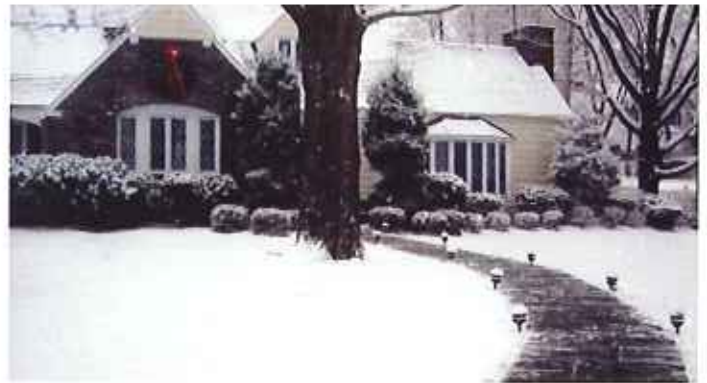
Our house in the winter