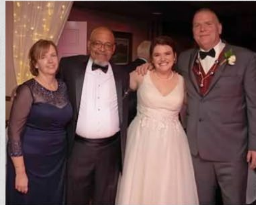
My doctor, my parents, and me at our wedding. He's been my doc for 30+ years!