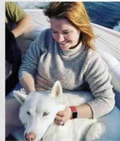
I love animals-especially dogs!