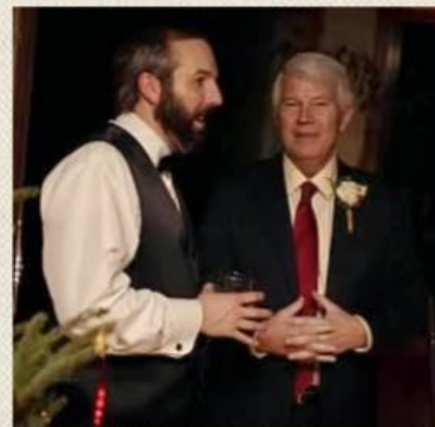
My dad imparting wisdom at my wedding reception.