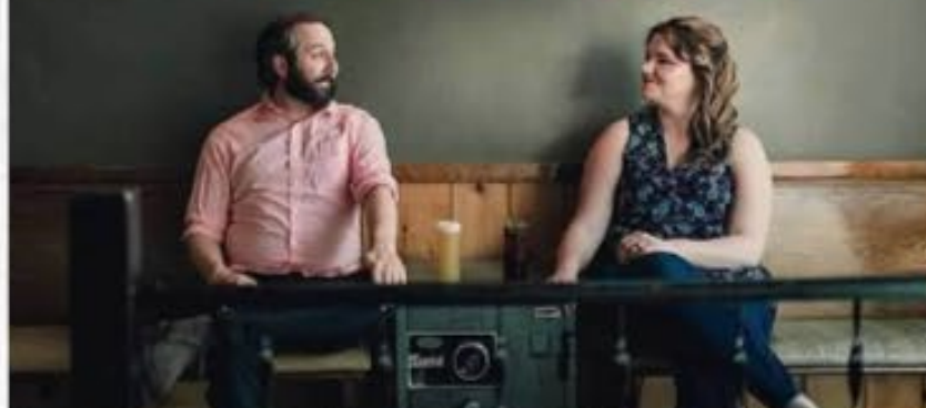
At one of the local pubs where we spent our time together as friends before dating.

How could it not make me laugh? Imagine someone yelling that question at you while they are sitting next to you. It was a good test from him, but an even better indicator for me that we were going to be important in each other's lives forever.