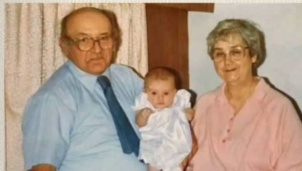
Gramps, Gram, and Baby Me on my baptism day in 1989.