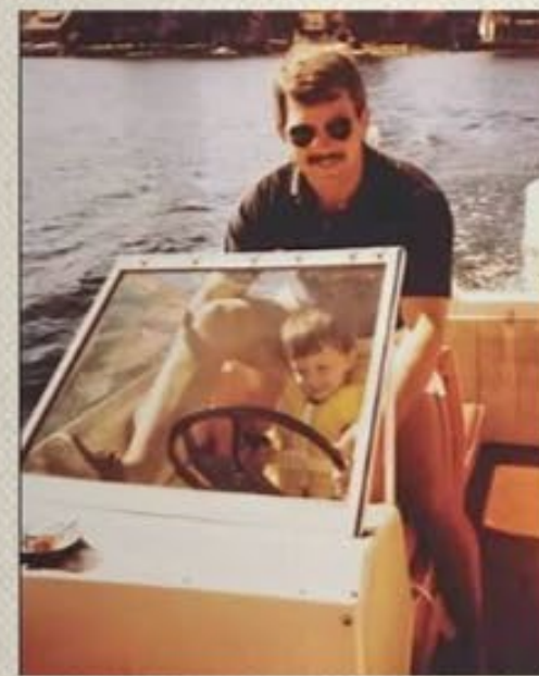
My dad and me on a boat in the Finger Lakes in the late '80s.