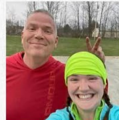
My dad and me before our 1st bike ride of the season.