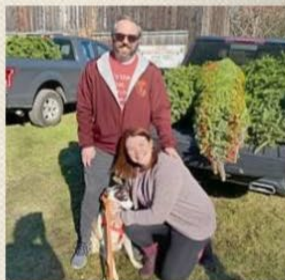
Annual Christmas Tree Farm trip.