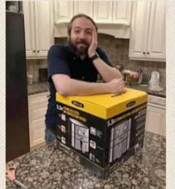
I like to cook and make it healthy whenever I can, so we bought this airfryer to help.