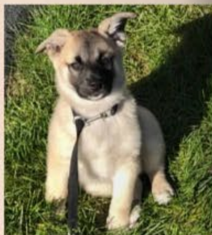
How cute was I as a pup?!