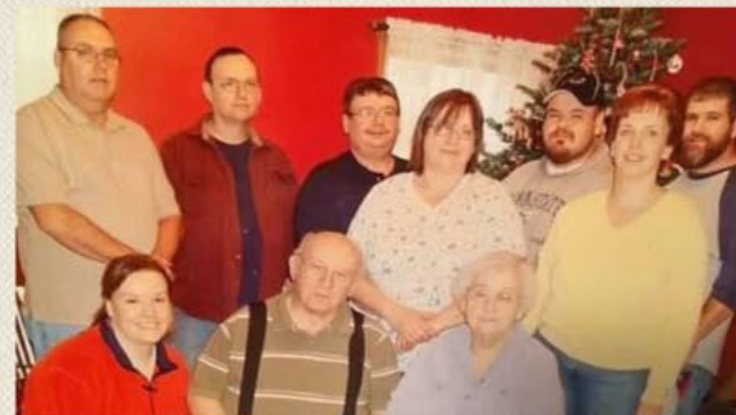
My Grandparents, plus Mom & her 7 siblings in the late 2000s.