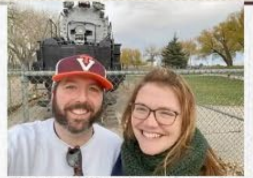
Cheyenne, Wyoming in front of the remaining "Big Boy" engine.