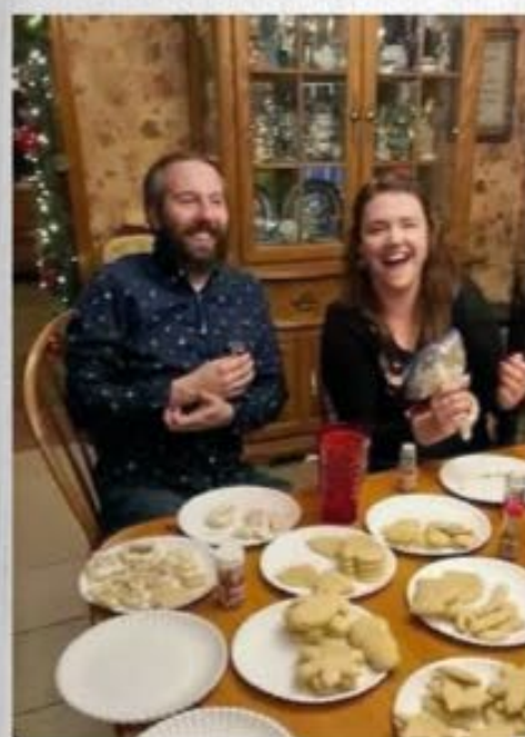
Sugar cookie decorating at the farm.