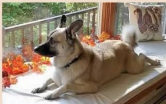
I wait for Mom and Dad in the bay window when they don't work from home.