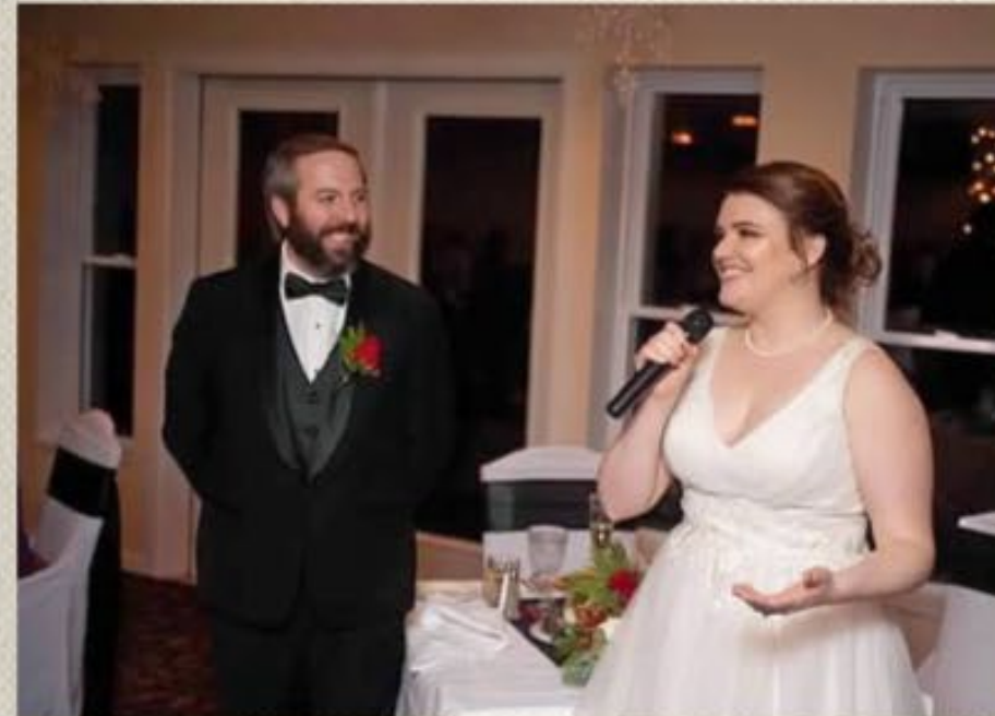
Both of us are comfortable performing, so our wedding thank you speech was fun for us and the guests.