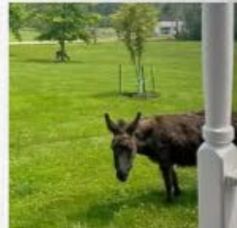
The view from the front door when Peanut Butter is in the yard.