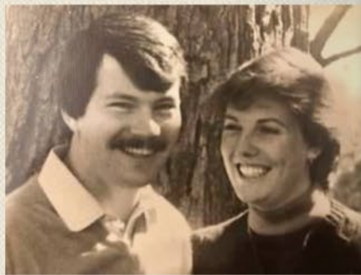
My mom & dad were married for 30 years before my mom passed in 2018.

My family is extremely supportive of our decision to adopt and they cannot wait to meet your baby!