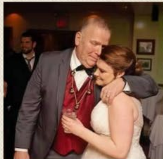
My dad hugging me at my wedding.