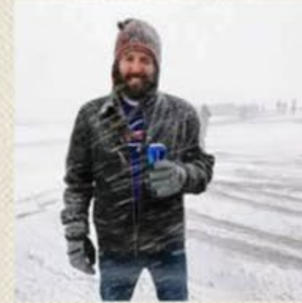
I like football and I will stand in a blizzard to watch it!