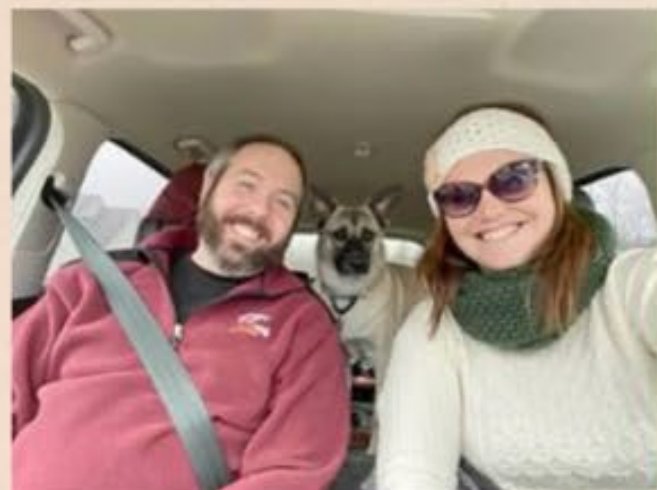
I love car rides! This time we drove to a farm and cut down a Christmas tree!